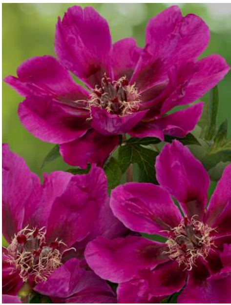
itoh Purple Sensation (1995) Early | Pot