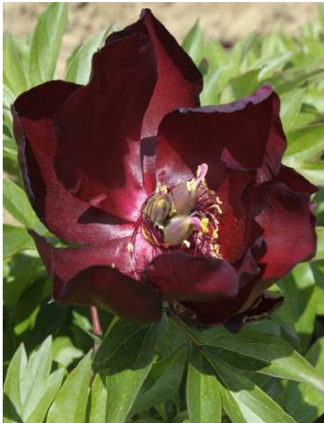
itoh Simply Red (-) Mid. | Pot