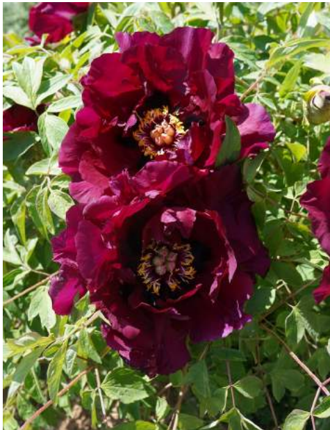
Rockii-Flare Flashlight (Jing Long Wang Yue) | Mid.