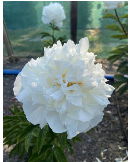
Mistress (1949) Late