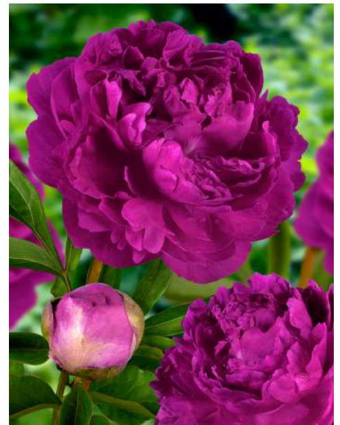
Victoire de la Marne (1915) Mid. | Pot