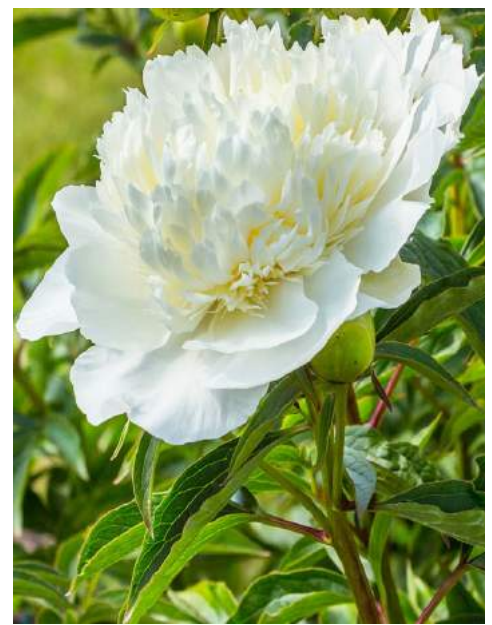
White Charm (1964) Early