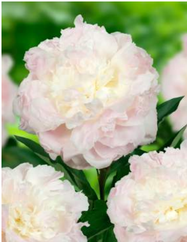
Paeonia Florence Nicholls