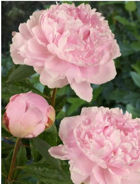
Sarah Bernhardt (1906) Late | Pot