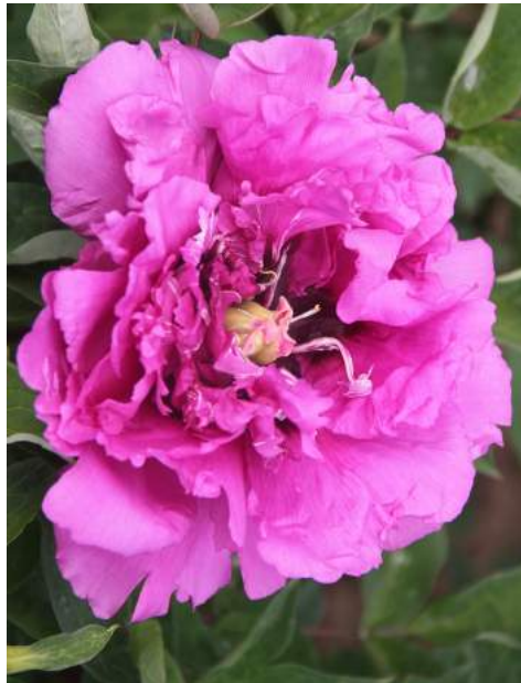
Rockii-Flare Ballroom (Lan Hai Cha Cui) | Mid.