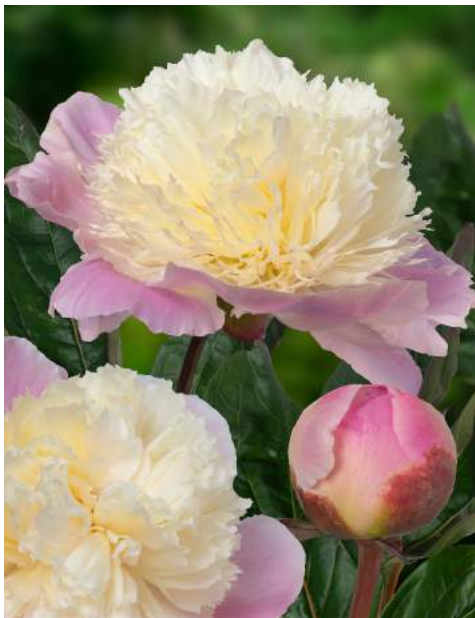
Touch of Class (1999) Mid.