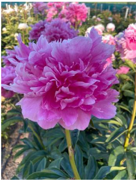
Glory Hallelujah (1970)