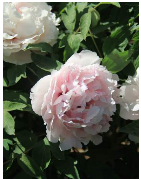
Rockii-Flare Firework (Jing Su Fen) | Mid.