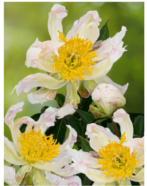
Green Halo (1999)