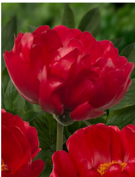
Red Red Rose (1942) Early