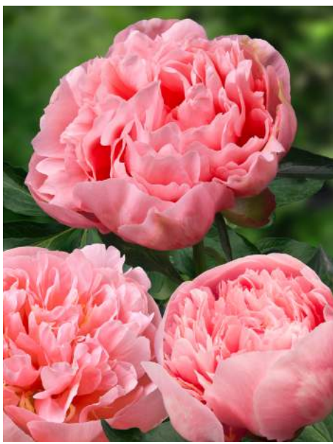
Etched Salmon (1981)