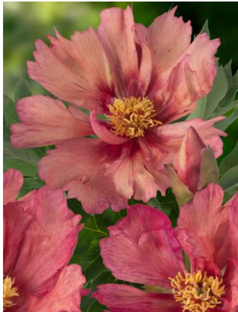
itoh Sonoma Kaleidoscope (2001) Mid. | Pot