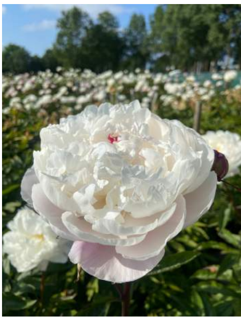
Vogue (1949) Mid.