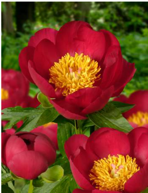
Scarlet O'Hara (1956) Early