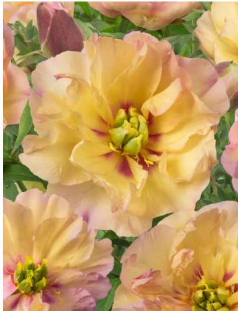
itoh Canary Brilliants (1999) | Mid. | Pot