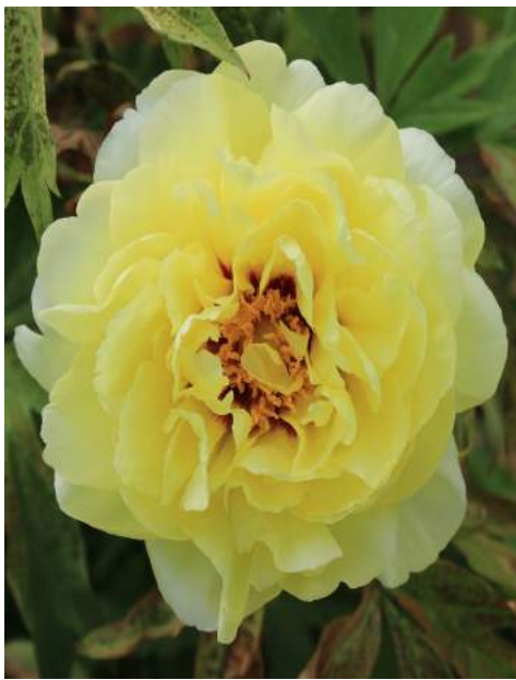
Lutea High Noon Mid.