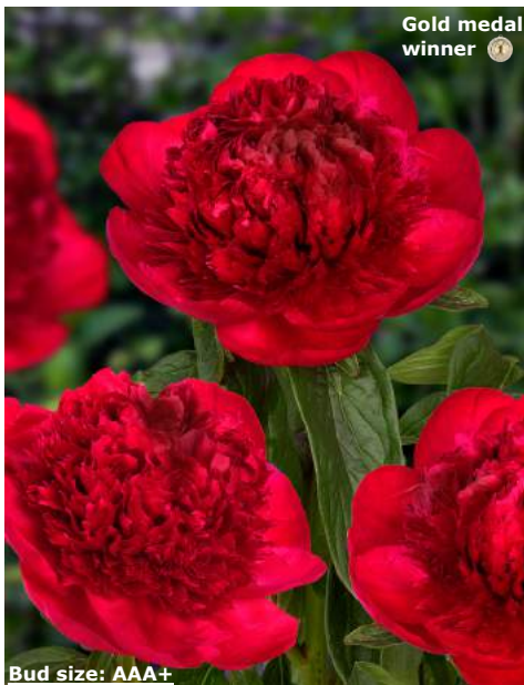
Red Charm (1944) Early