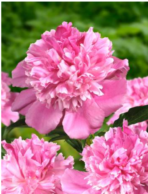
Bouquet Perfect (1987)