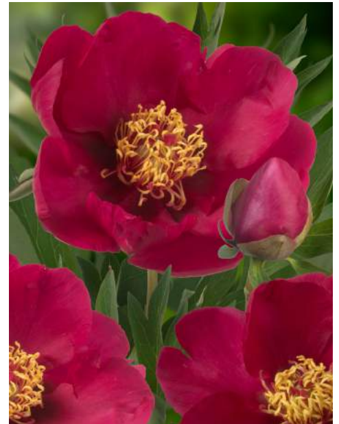
itoh Tolomeo Nr. 59 (2012) Mid. | Pot