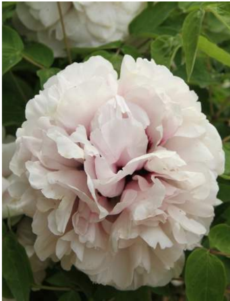
Rockii-Flare Baby Girl (Jing Juan Fen) | Mid.