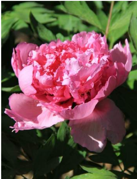
Rockii-Flare Gentle Touch (Qian Zi Bai Tai) | Mid.