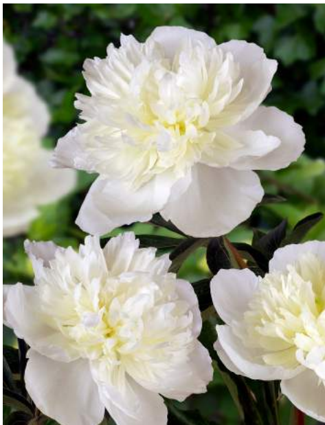
Duchesse de Nemours (1856) | Mid.