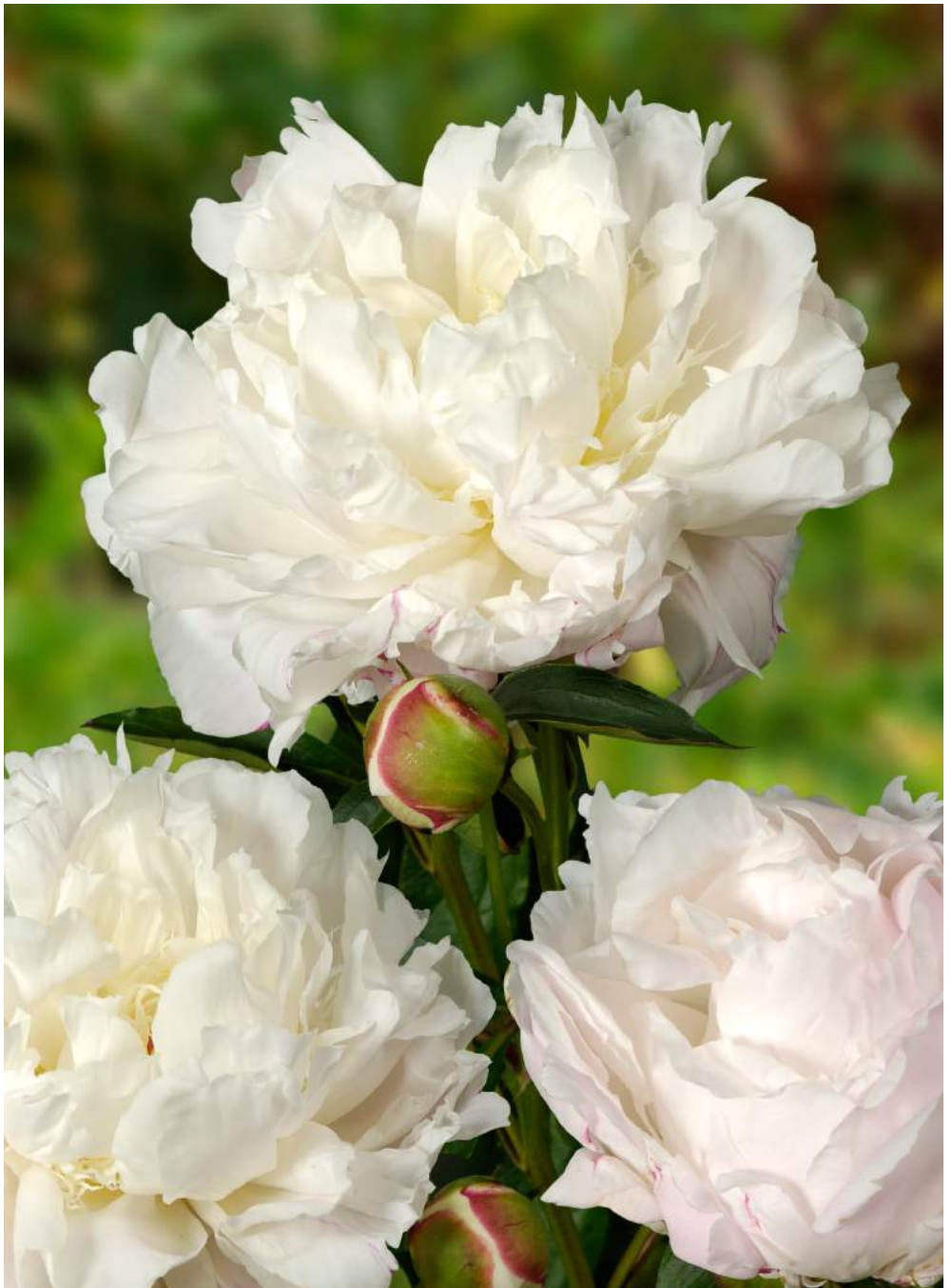
Shirley Temple (<1948) Mid.