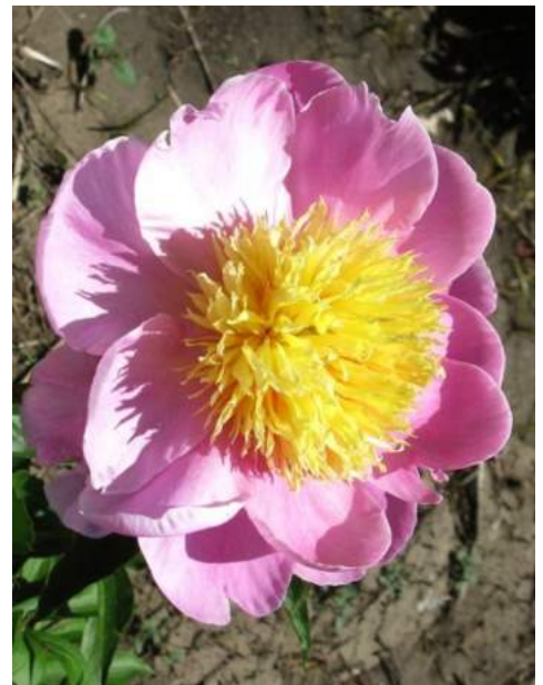
Nippon Gold (1929) Late