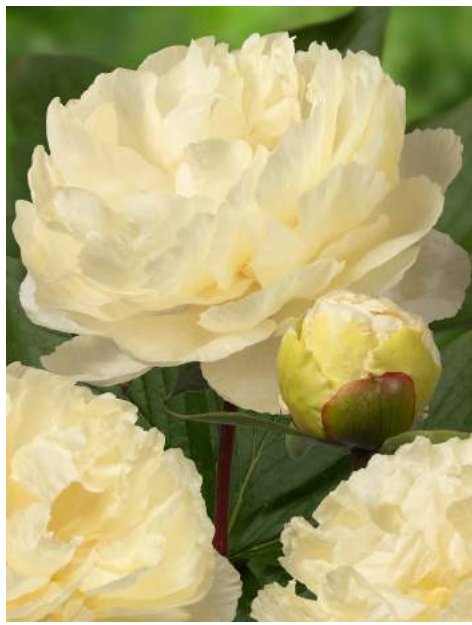
Sunny Girl (1985) Very early