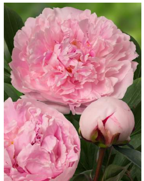
Reine Hortense (1857) Mid.