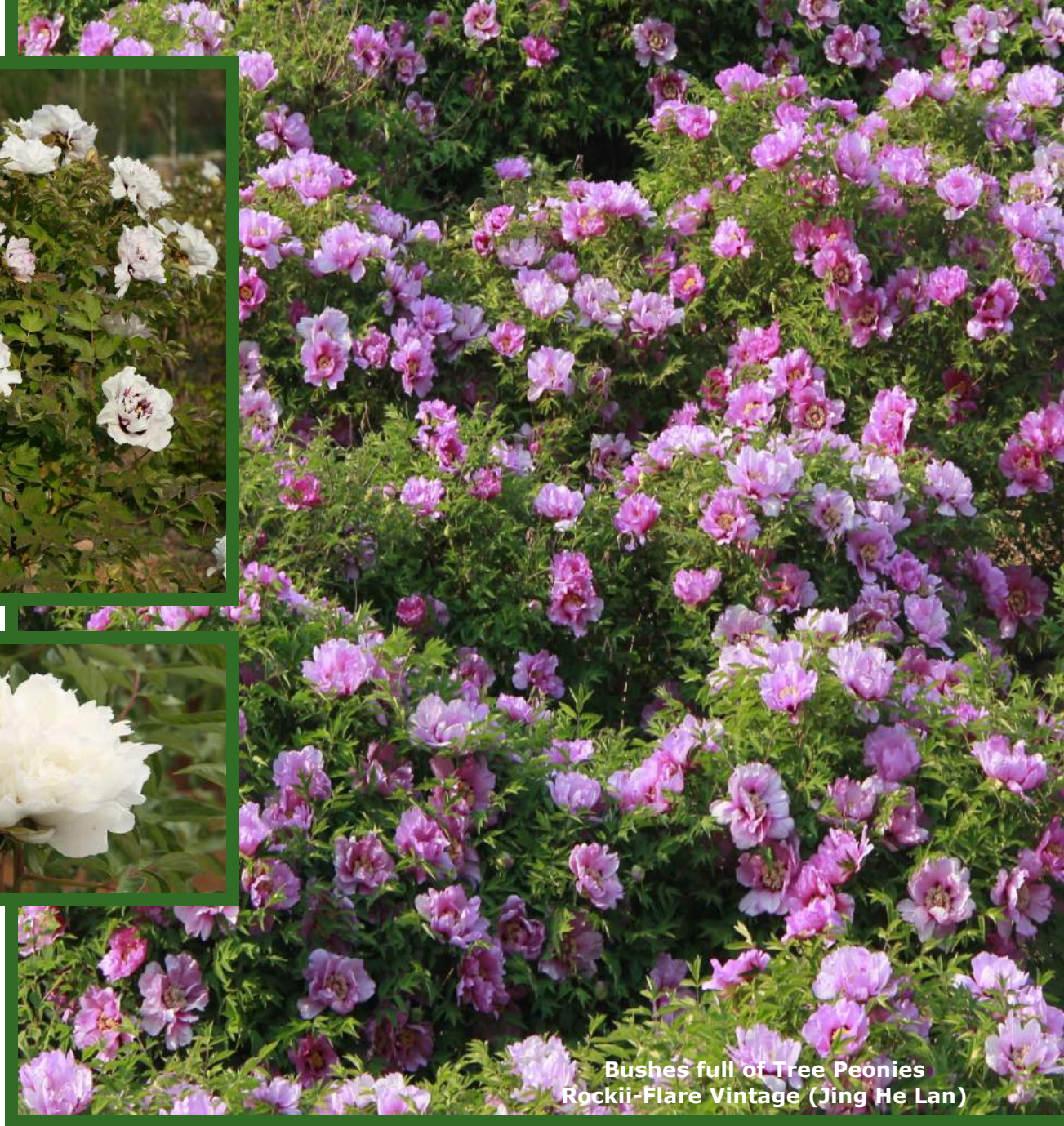
Bushes full of Tree Peonies Rockii-Flare Vintage (Jing He Lan)