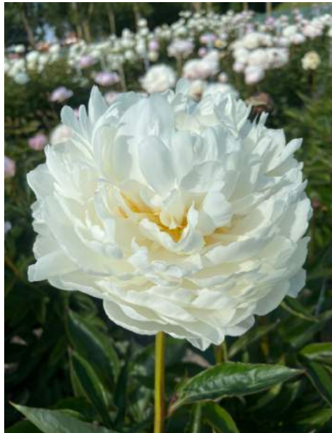
White Ivory (1981) Mid.