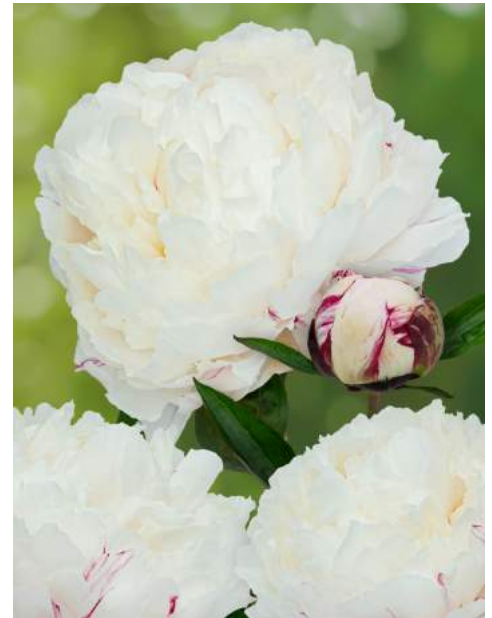
White Lullaby (2000) Mid. - late | Pot