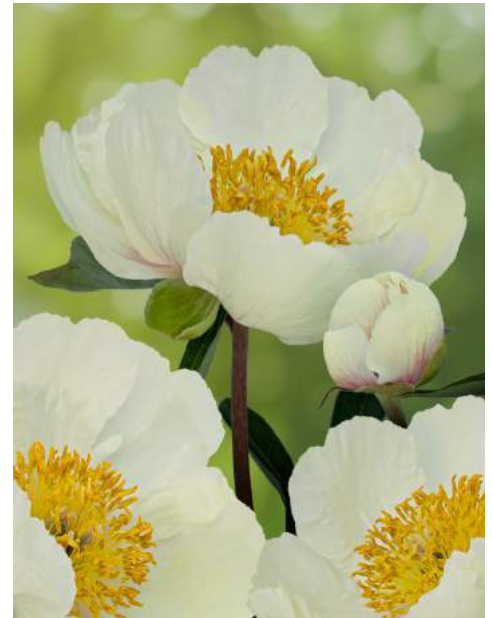
Claire de Lune (1954)