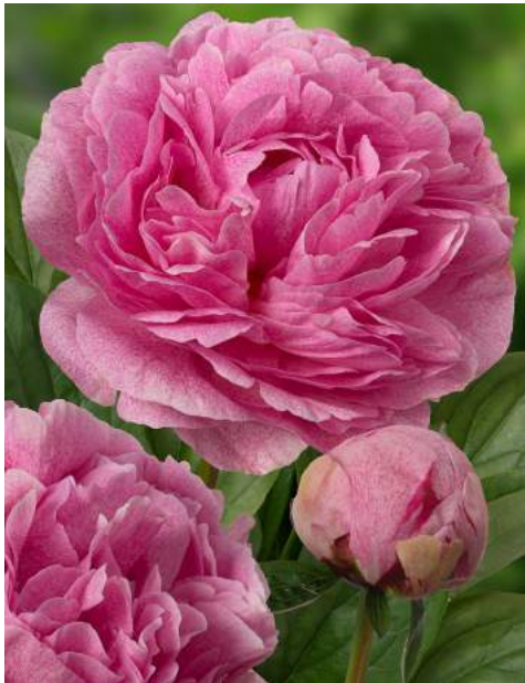
The Fawn (1996) Mid.