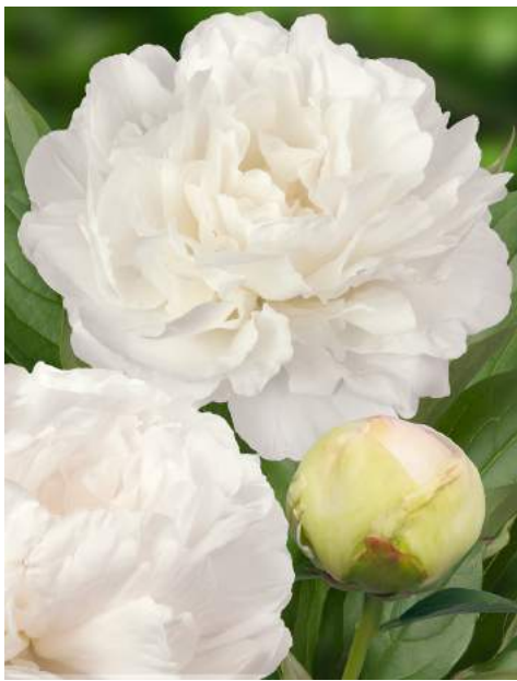
Puffed Cotton (2003) Mid.