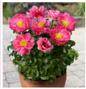
Patio Peony™ Athens