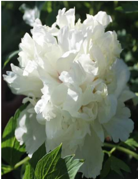
Rockii-Flare Whitewash (Ping Ding Iv) | Mid.