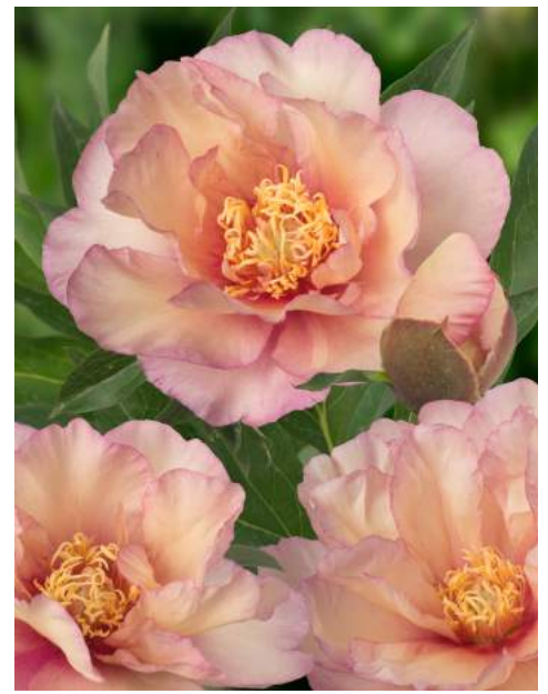
itoh Scrumdiddleumptious (2002) Mid. - late | Pot