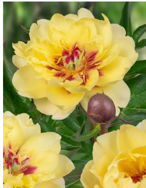
itoh Yellow Waterlily (1999) Mid. | Pot