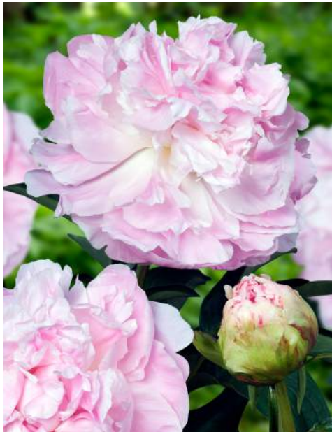
My Love (1992) Early - mid.