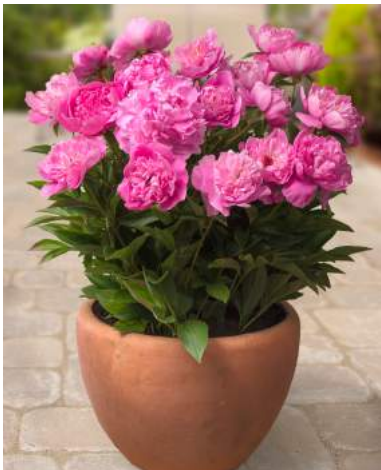
Patio Peony 'Rome'