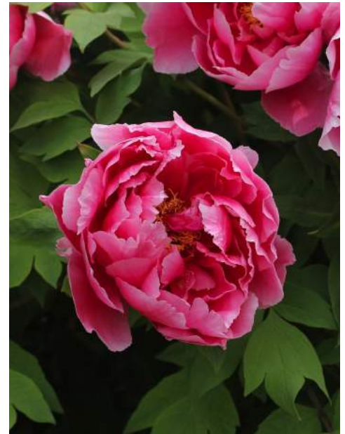
Suffruticosa Dragon Wing (Xin Qi Fu Shen) | Mid.