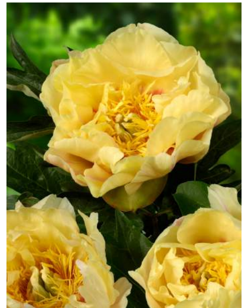
itoh Prairie Charm (1992) Mid. | Pot