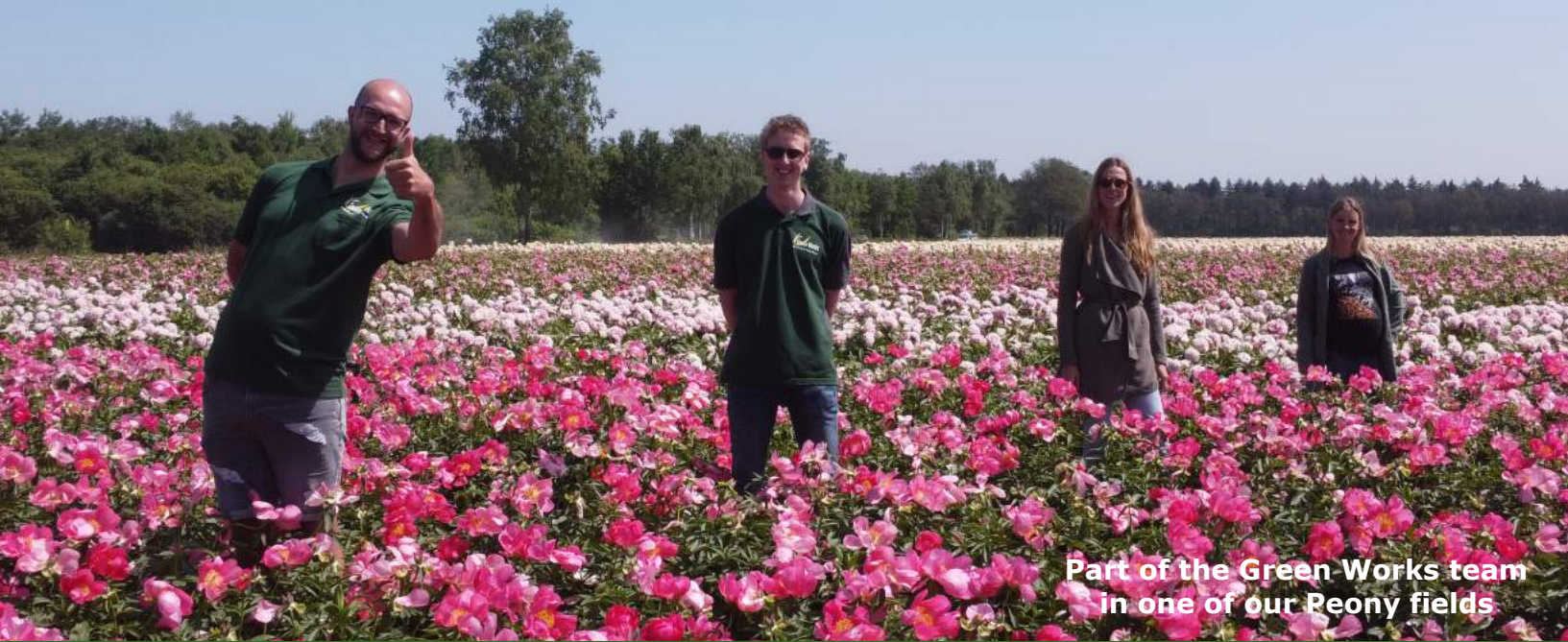
Part of the Green Works team in one of our Peony fields