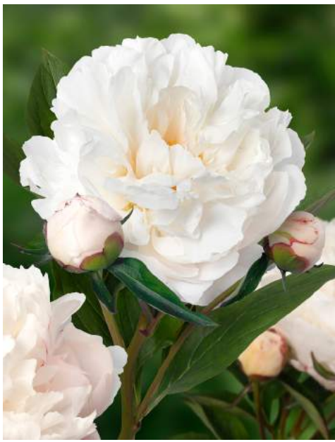
Steve's Choice (-) Mid. | Pot