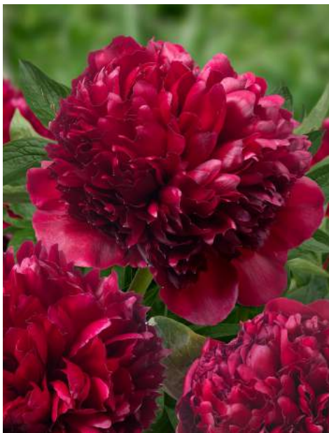
Red Grace (1980) Early