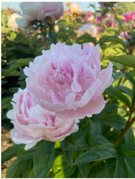
Lady Orchid / Pink Diamond (1942) Mid. - late