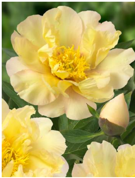
itoh Lemon Dream (1999) Mid. | Pot