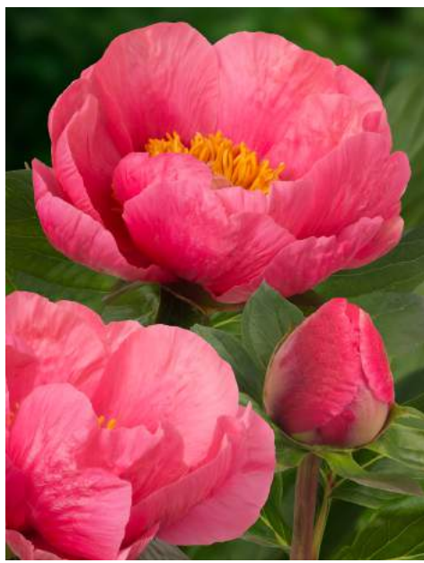
Lovely Rose (1942) Early | Pot