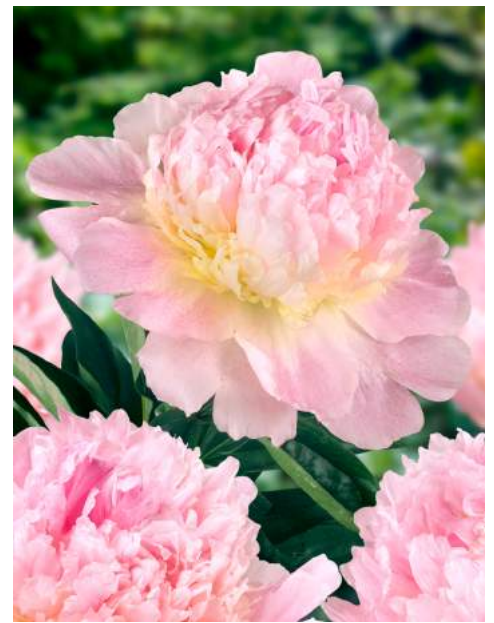
Raspberry Sundae (1968) Early - mid.