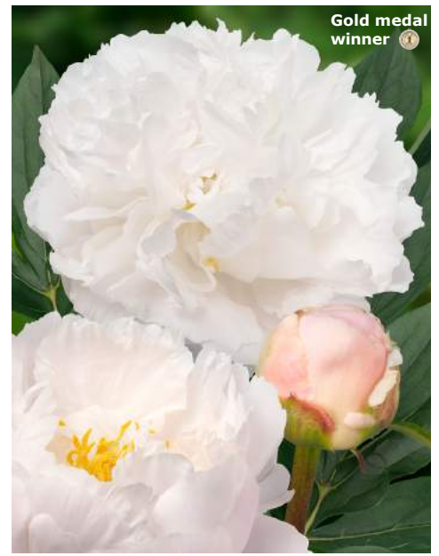
Miss America (1936) Early | Pot