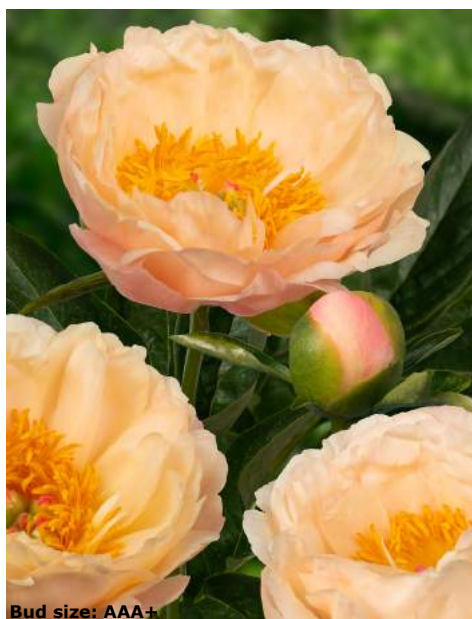
King's Day (2019)