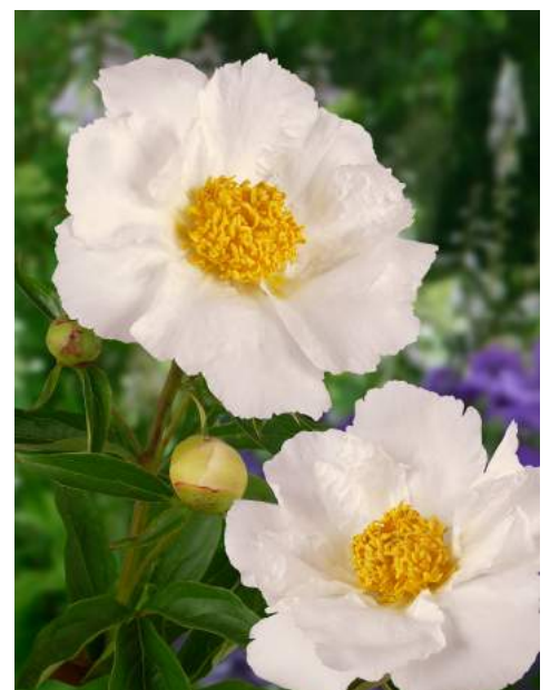
Krinkled White (1928)