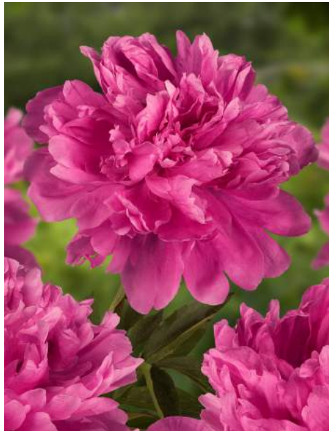
Amabilis (Pink Panther) 1978)