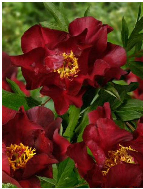
itoh Scarlet Heaven (1999) Early - mid. | Pot