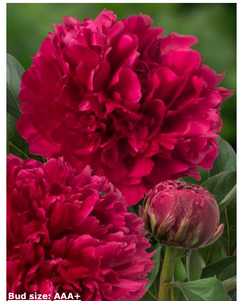
Red Magic (1950) Early - mid.