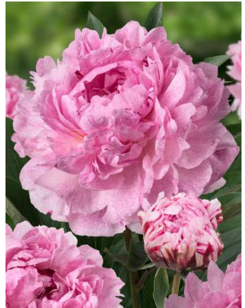
Sarah Bernhardt Unique (1997) Late