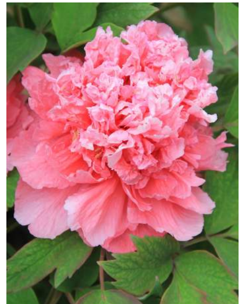
Suffruticosa Pink Sky (Hu Hong) | Mid.