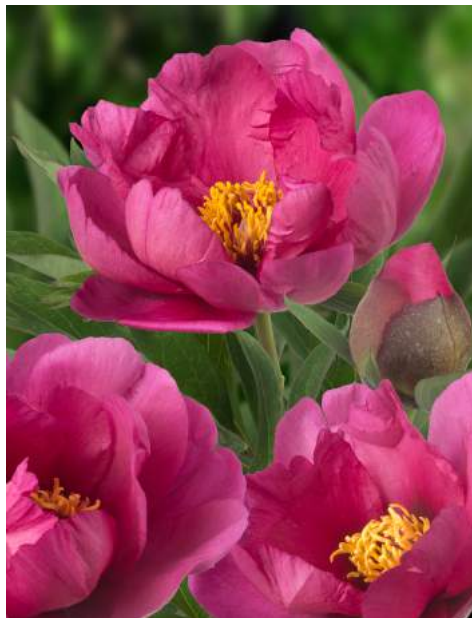
itoh Pink Ardour (1995) Mid. | Pot