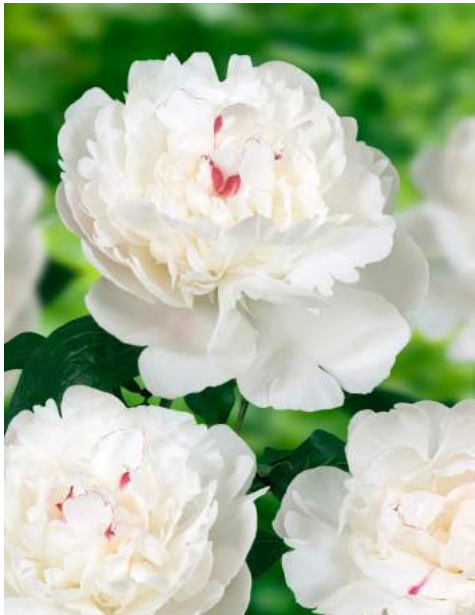
Festiva Maxima (1955)