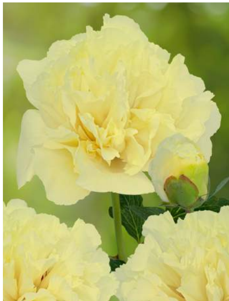
Vanilla Schnapps (2013) Very early