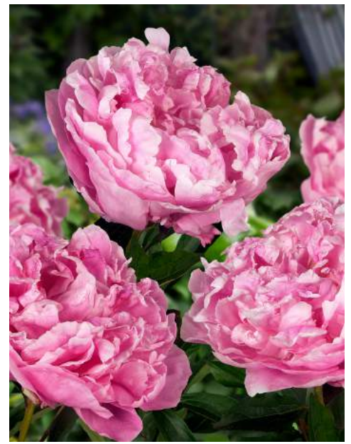
Alexander Fleming (<1950)