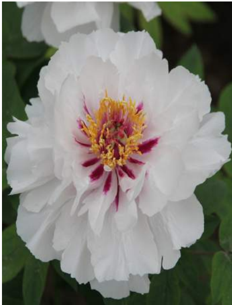
Suffruticosa Bulls Eye (Yue Gong Zhu Guang) | Mid.