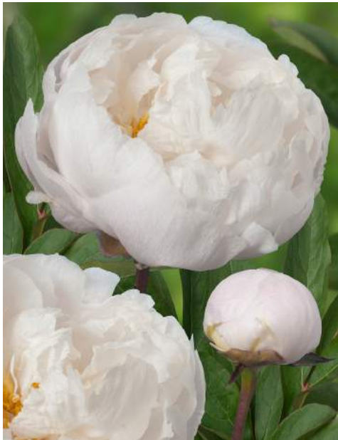
White Grace (2000) Mid.