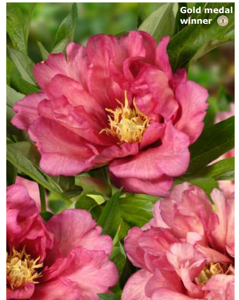
itoh Hillary (1999) | Early - mid. | Pot