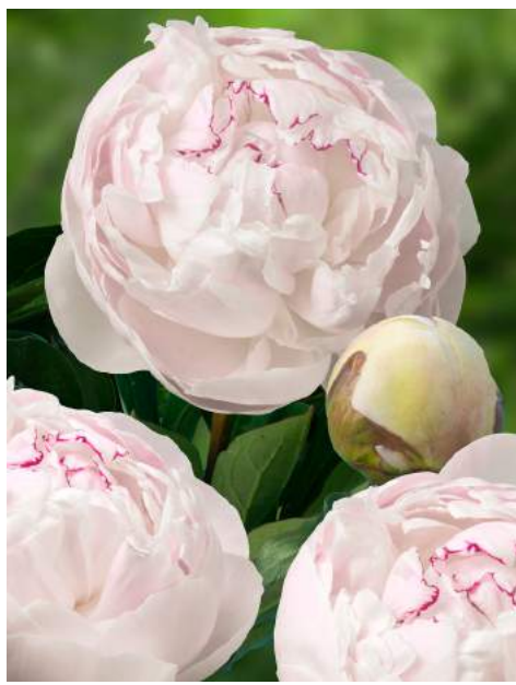
Odile (1928) Early