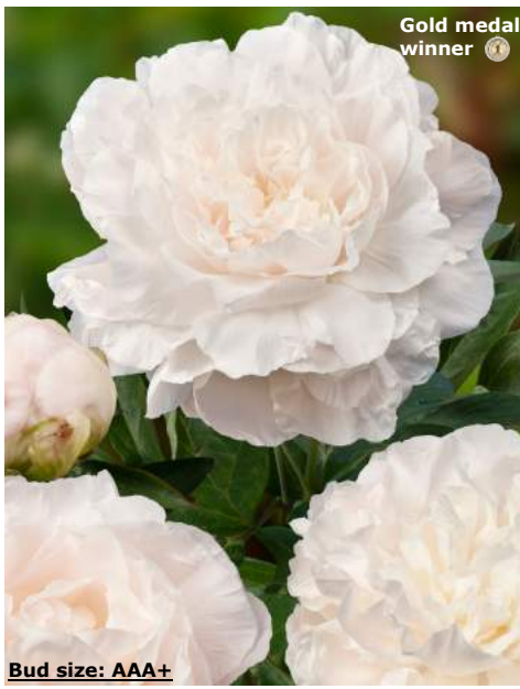
Mother's Choice (1950) Early - mid.