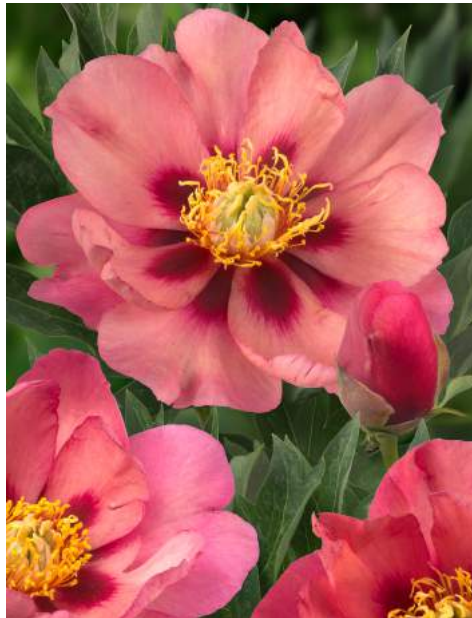
itoh Old Rose Dandy (1993) Mid. | Pot