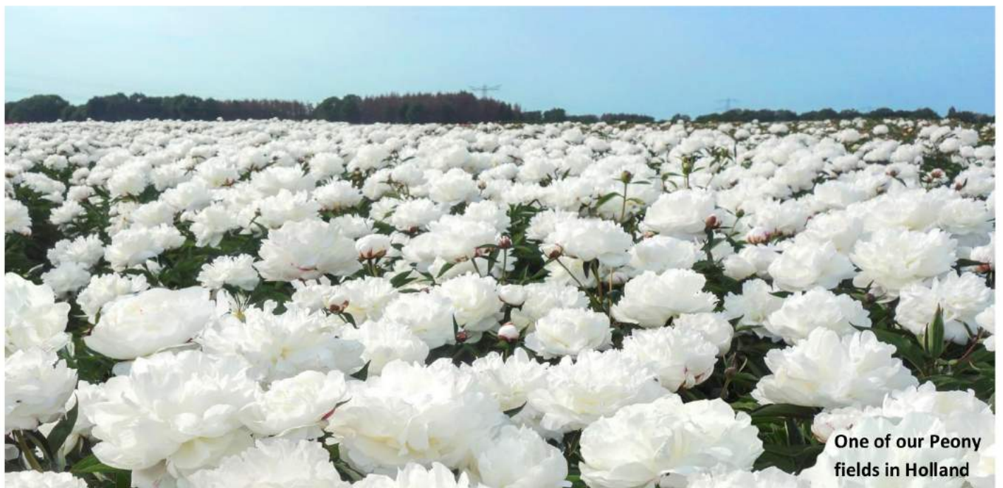
One of our Peony fields in Holland