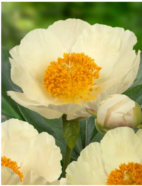
Moonrise (1949) Early | Pot