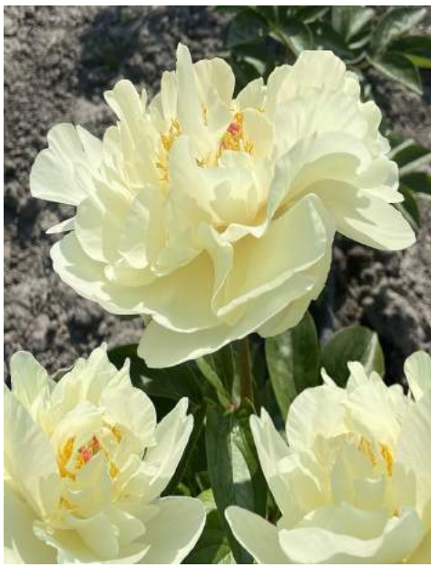
Early Sensation (1988) Early