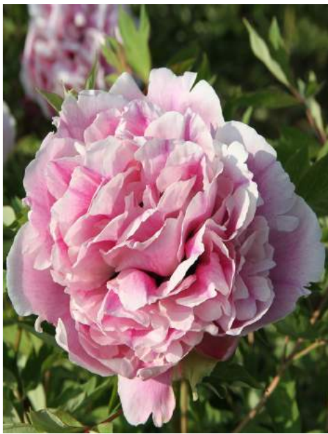
Rockii-Flare Fiesta (Guan Yin Mian) | Mid.