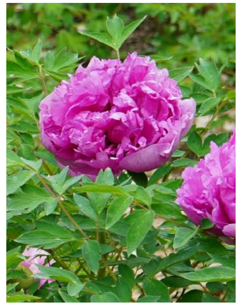
Rockii-Flare Abracadabra (Lan Guan Yu Dai) | Mid.