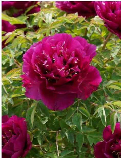
Rockii-Flare Dark Horse (Jing Mo Sa Jing) | Mid.