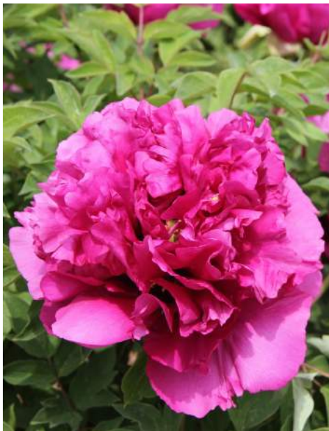
Rockii-Flare Noble Crown (Jing Zi Guan Yin Xian) | Mid.