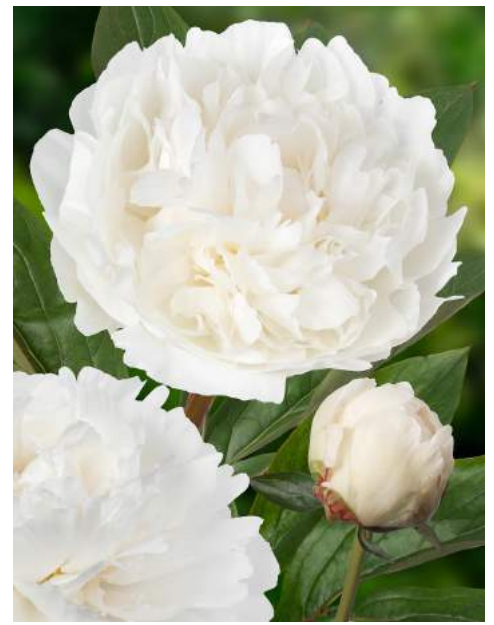
Snow Princess (1990) Mid.