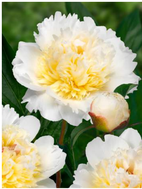
Bridal Grace (1999)