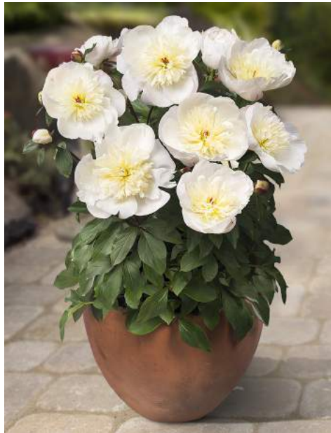
Patio Peony™ Madrid Late