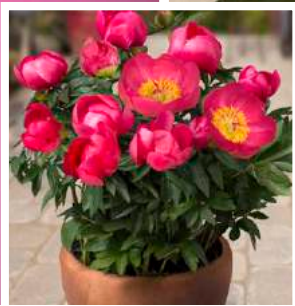
Patio Peony™ Oslo