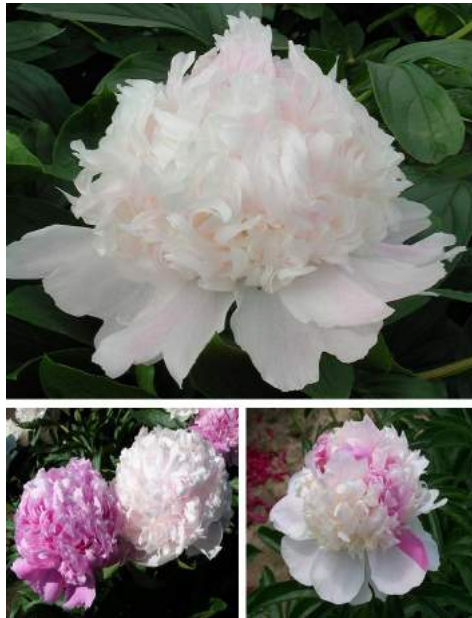
Mister Ed (1980) Early - mid.