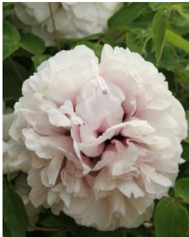
'Tree Peony Baby Girl'