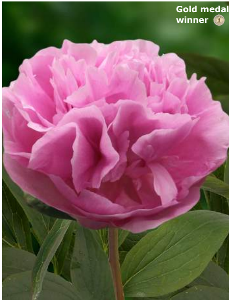
Myra MacRae (1967) Very late