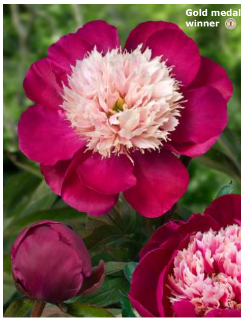
White Cap (1956) Early - mid.