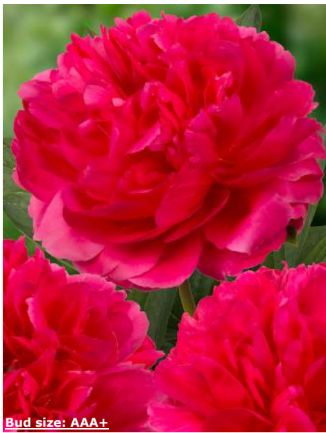
Raspberry Charm (1968) Early - mid.