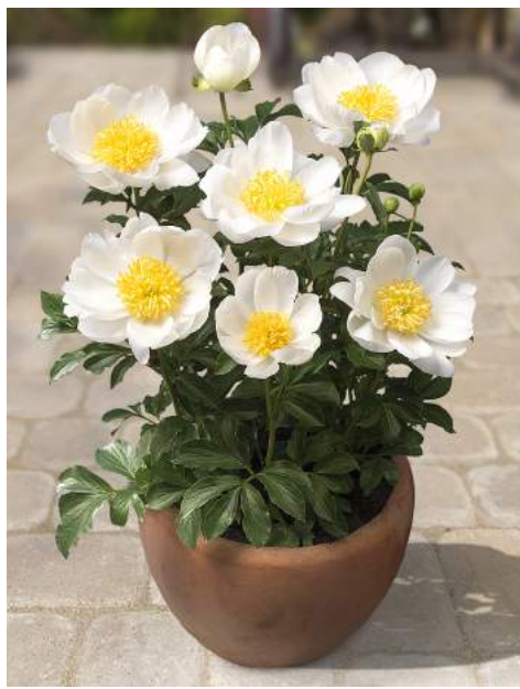
Patio Peony™ Dublin Late