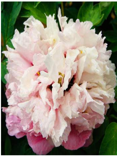
Rockii-Flare Sugarcone (Gui Chuan Fen) | Mid.