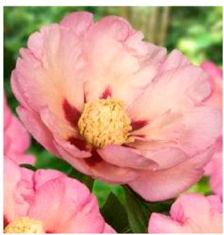
Itoh Pastel Splendor