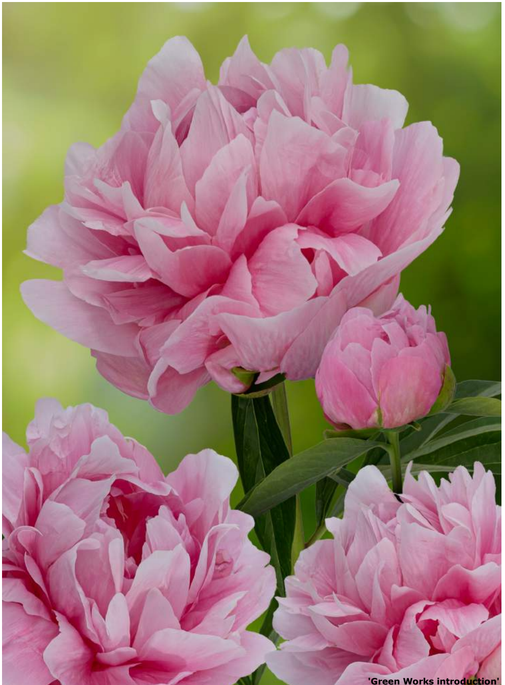
Early Flamingo® (2022) Very early