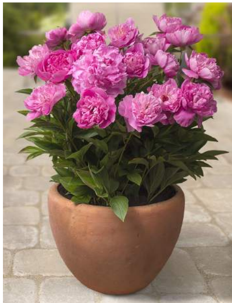
Patio Peony™ Rome Mid.