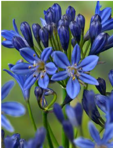
Agapanthus™ Summer Love®