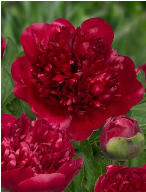
Christmas Velvet (1992)