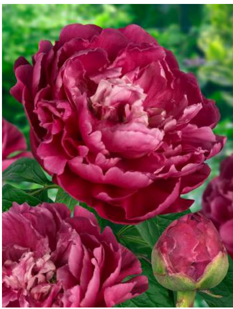
Louis van Houtte (1867) Early - mid. | Pot