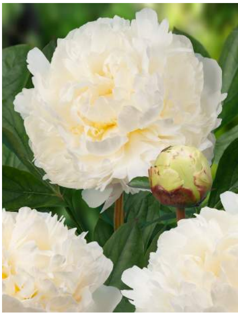
Ivory Victory (1988)