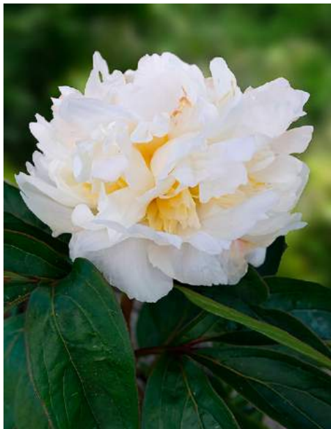
White Masterpiece (2003) Mid.