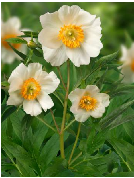
Early Windflower (1939) Very early | Pot