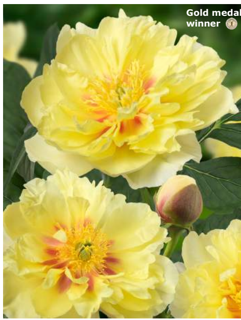
itoh Bartzella (1986) | Mid. | Pot