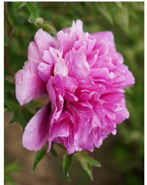
Rockii-Flare Dream (Jing Zui Mei) | Mid.