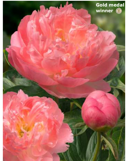
Pink Hawaiian Coral (1981)