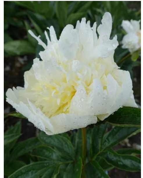
Bride's Dream (1965)