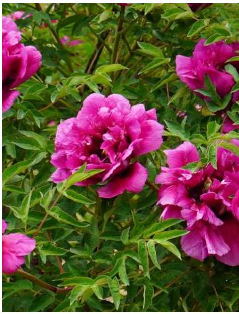
Rockii-Flare Rebel (Gao Yuan Sheng Huo) | Mid.