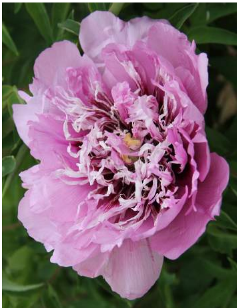
Rockii-Flare Mysterious (Mi Er Mei) | Mid.