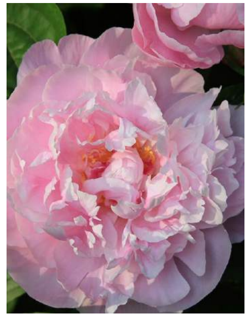
Sweet Rewards (2003) Mid. | Pot