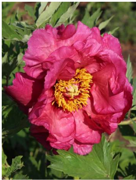
Lutea Tropical Mid.