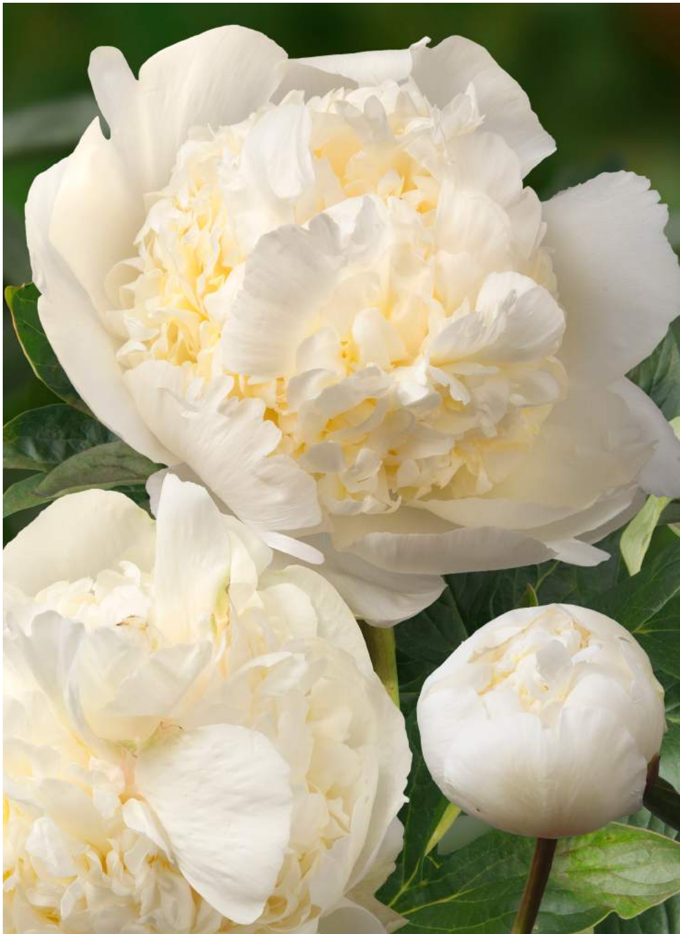
Bridal Shower (1959)