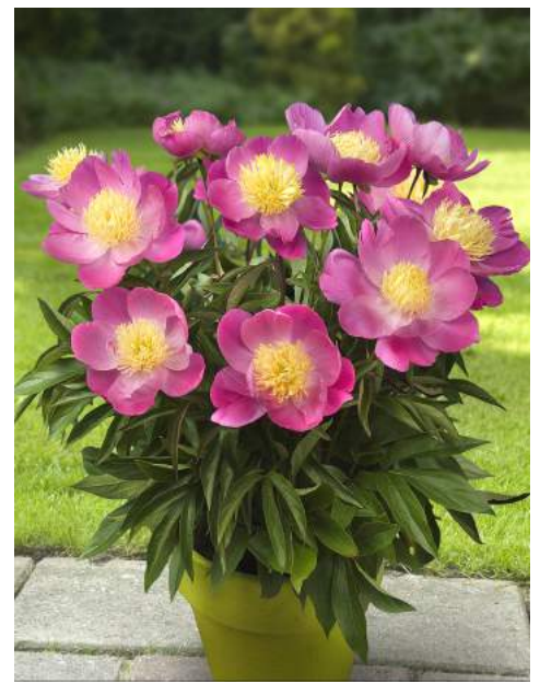
Patio Peony™ Kiev Mid.