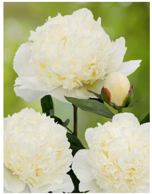
Lancaster Imp. (1987) Early | Pot