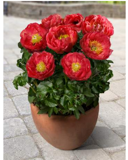
Patio Peony™ Moscow Early - mid.