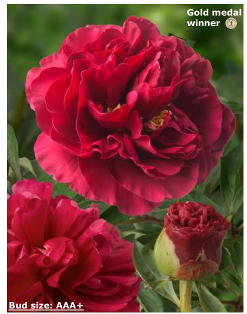
Ole Faithful (1964) Late