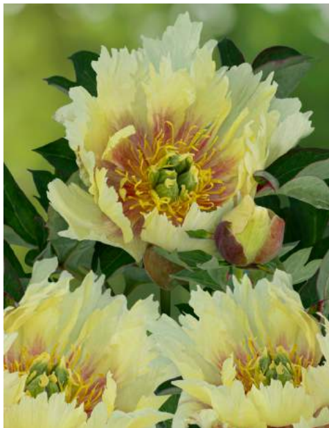
itoh Yellow Dream (1964) Mid. | Pot