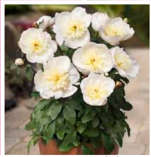
Patio Peony™ Madrid