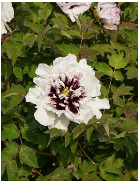
Rockii-Flare Eagle Wings (Jing Yu Tian Cheng) | Mid.