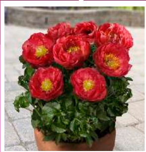
Patio Peony™ Moscow