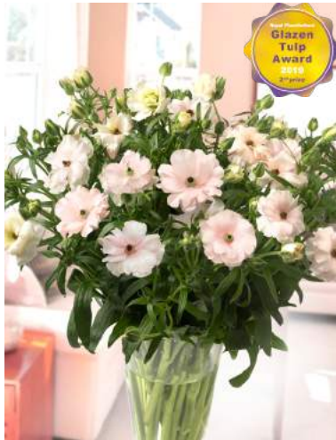
Ranunculus Butterfly™ Ariadne®