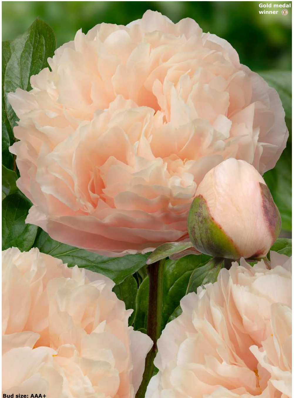
Pastelegance (1989) Early - mid.