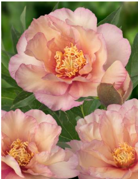
itoh Pastel Splendor (1996) Mid. | Pot