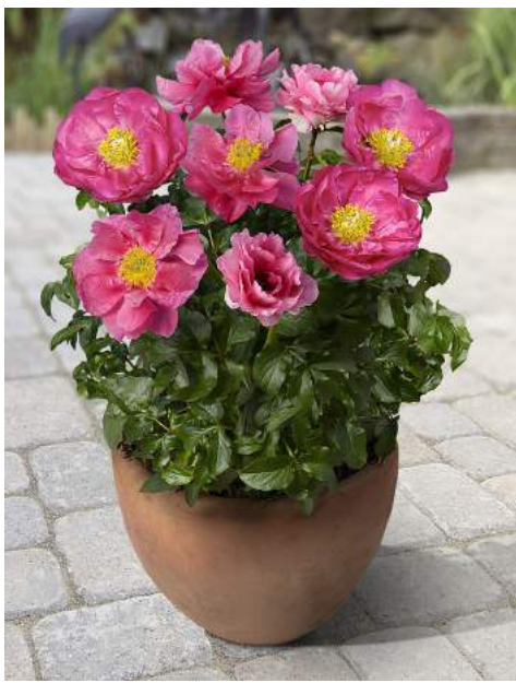
Patio Peony™ Athens Very early