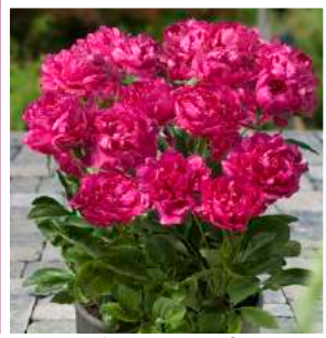
Patio Peony™ London