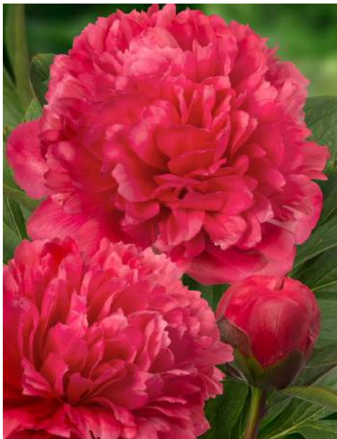
Lorelei (1996) Early - mid.