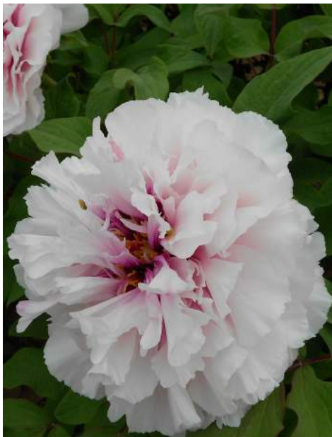
Suffruticosa Multiply (Xue Ying Tao Hua) | Mid.