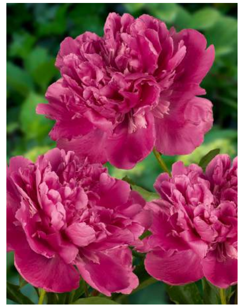
Edulis Superba (1824) Early - mid. | Pot