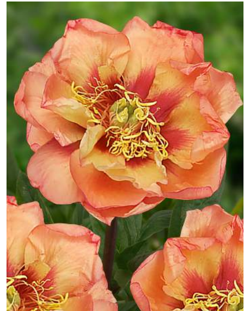
itoh Orange Victory (2001) Early - mid. | Pot