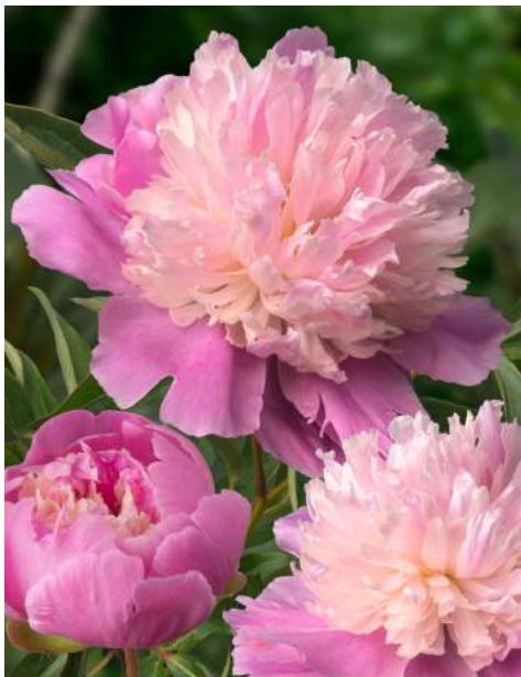
Sorbet (<1987) Late