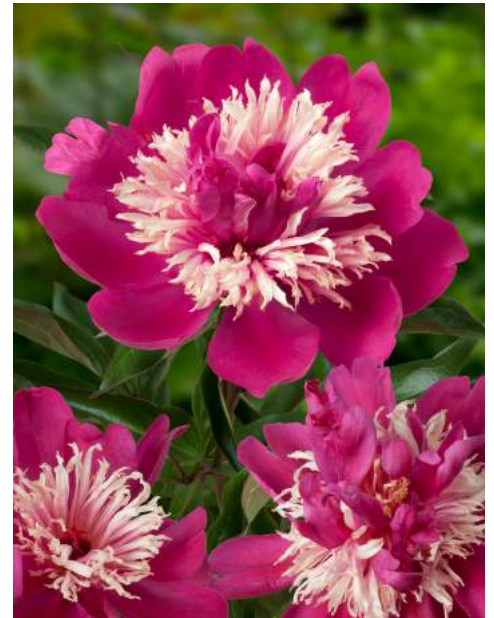
Top Hat (1971) Early - mid. | Pot