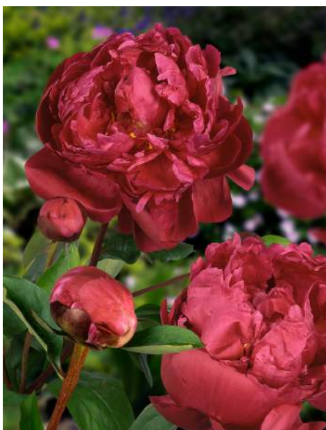
Red Sarah Bernhardt (1970) | Mid.