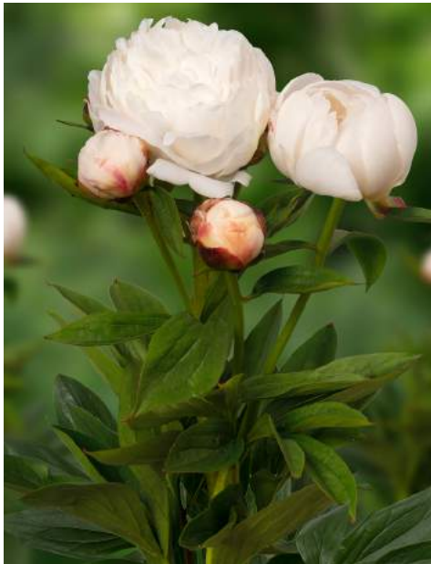
Allan Rogers (2008)