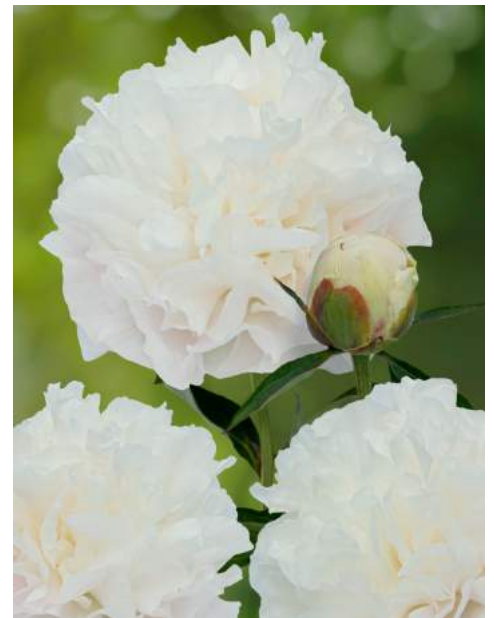
Moonlit Snow (1978) Mid.