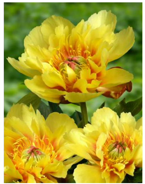
itoh Border Charm (1984) | Mid. - late | Pot