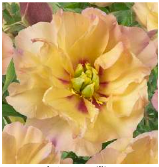
Itoh Canary Brilliants