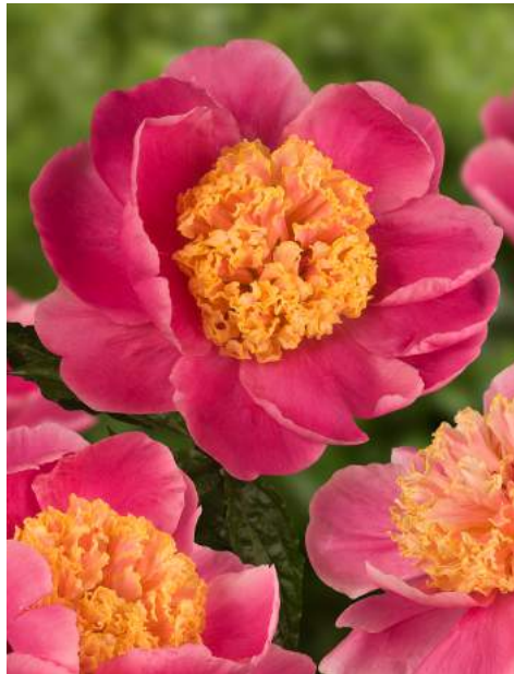
Doreen (1949) Late