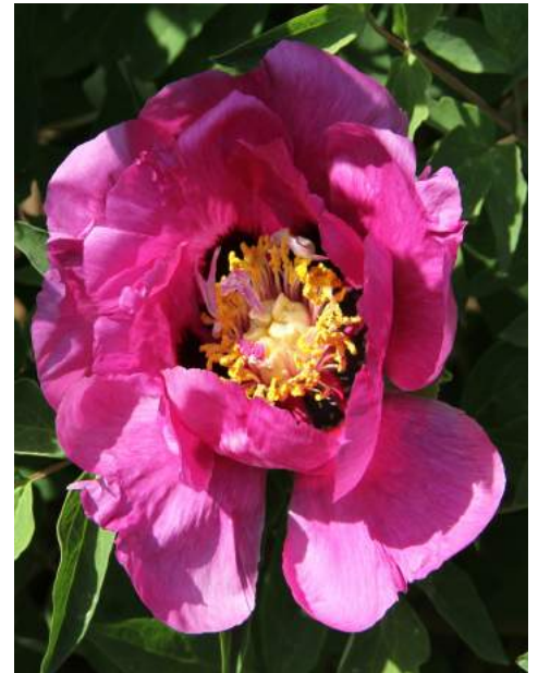
Rockii-Flare Bingo (Jing Hong Ying Bo) | Mid.