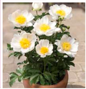
Patio Peony™ Dublin