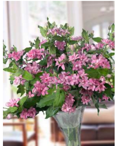
Oxypetalum Bridal Juliette