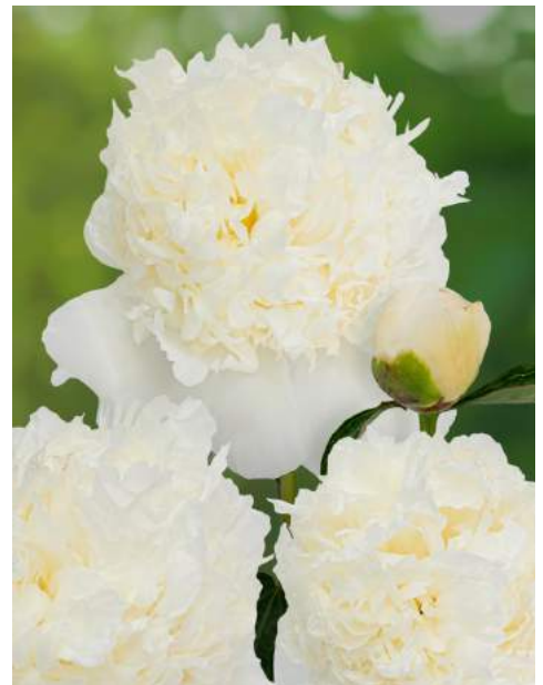
Princess Bride (1988)