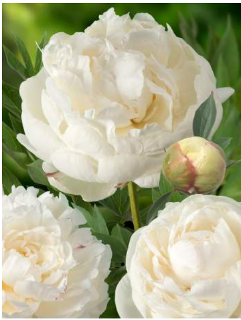
Snow Mountain (1946) Late