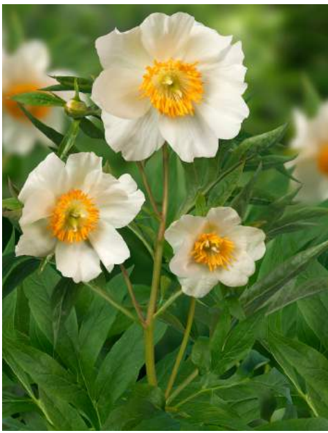
Early Windflower (1939) Very early | Pot