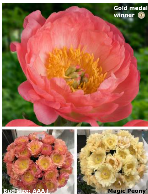
Coral Sunset (1965)