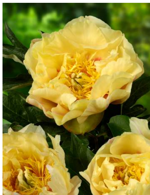
itoh Prairie Charm (1992)