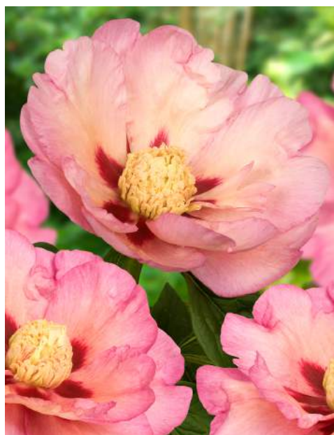
itoh Pastel Splendor (1996)