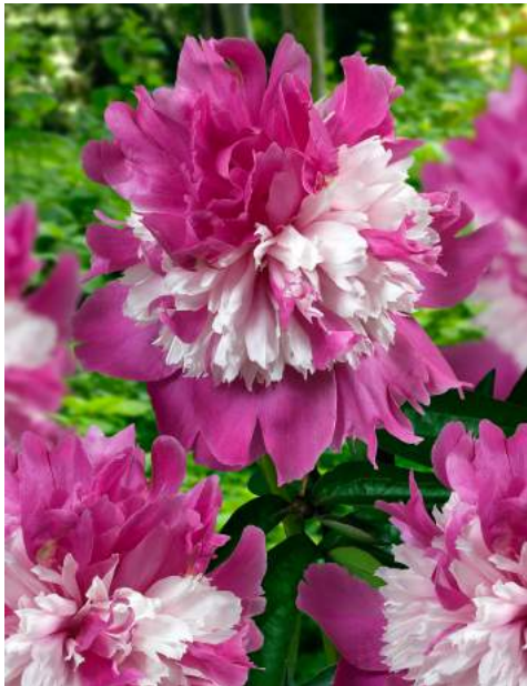
Celebrity (1985) Early - mid.