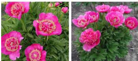
Anemoniflora (<1900) Very early | Pot