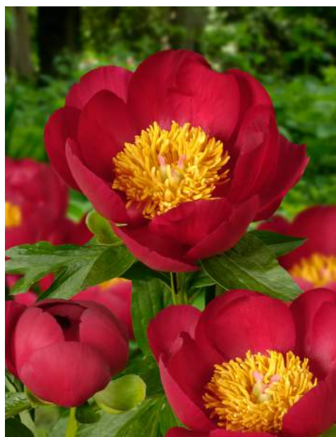
Scarlet O'Hara (1956)