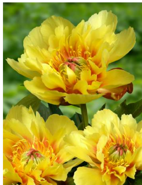
itoh Border Charm (1984) Mid. - late | Pot