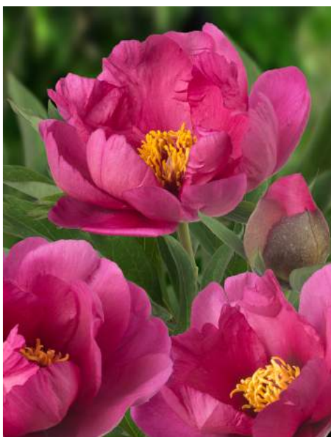
itoh Pink Ardour (1995)