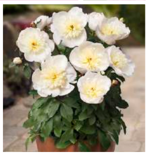
Patio Peony™ Madrid