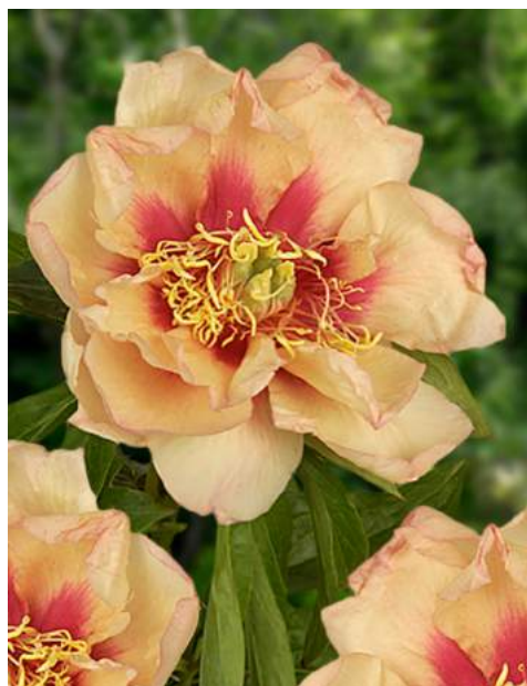
itoh Callie's Memory (1990) Early - mid. | Pot