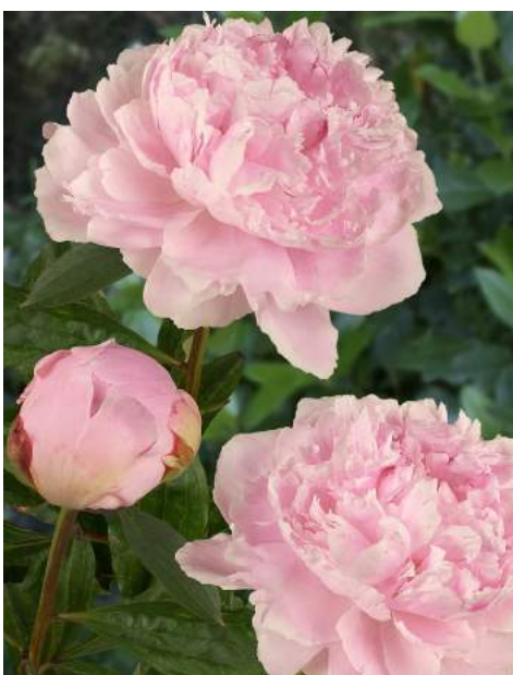
Sarah Bernhardt (1906)