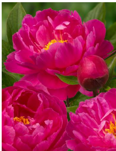
Nice Gal (1965)