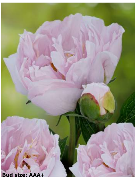
Pink Vanguard (2005)