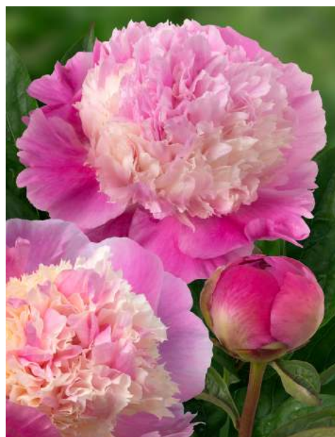
She's My Star (2000)