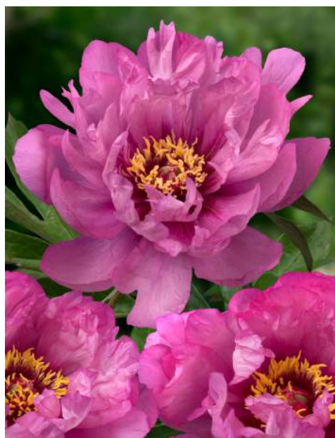
itoh First Arrival (1986) Early | Pot