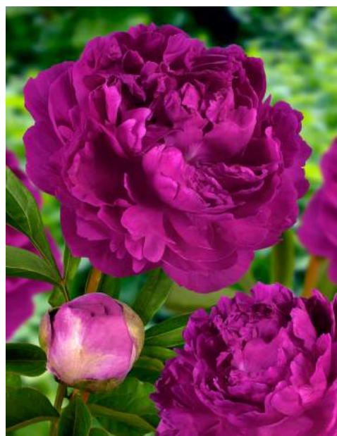
Victoire de la Marne (1915)