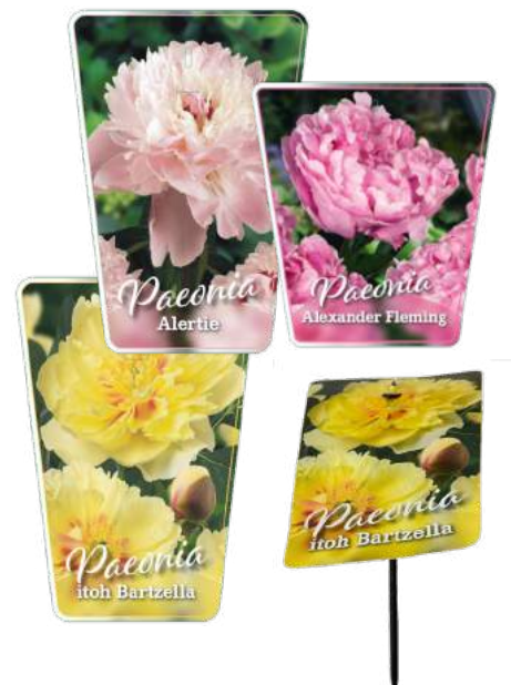
Order your Peony Labels at Green Works