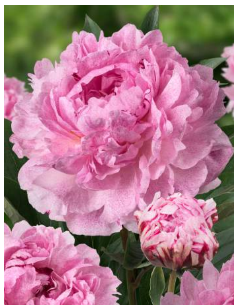
Sarah Bernhardt Unique