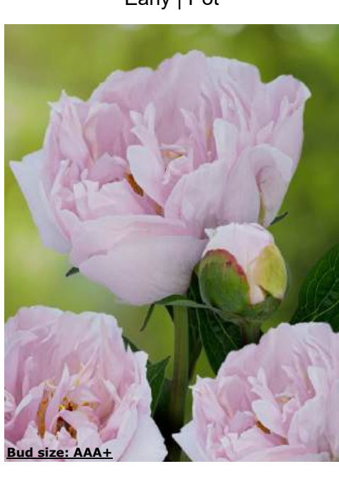
Pink Vanguard (2005) Very early