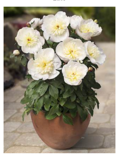
Patio Peony™ Madrid Late