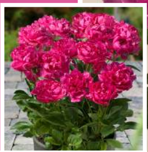
Patio Peony™ London