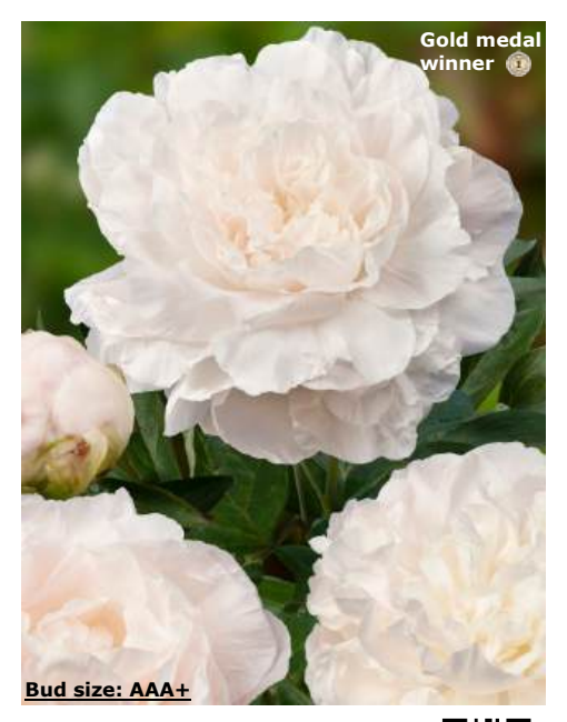
Mother's Choice (1950) Early - mid.