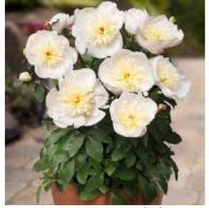
Patio Peony™ Madrid