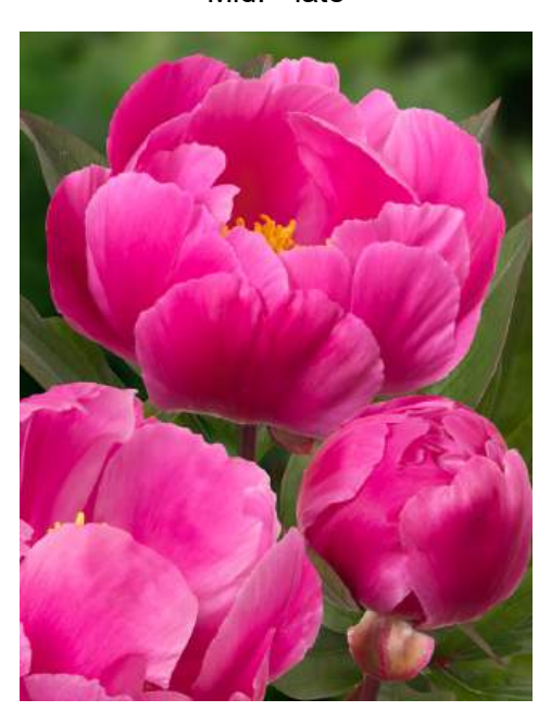
Paladin Candy (1950) Early - mid. | Pot