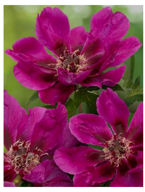
itoh Purple Sensation (1995) Early | Pot