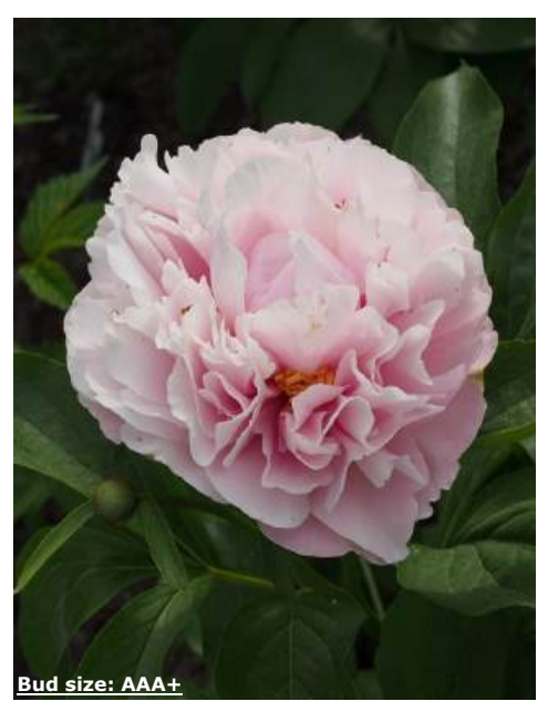
Sky Dance (2017) Very early