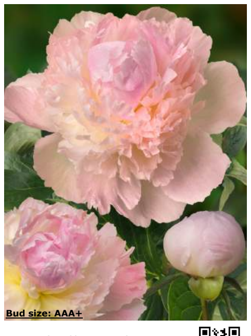
Chiffon Parfait (1981) Early - mid.