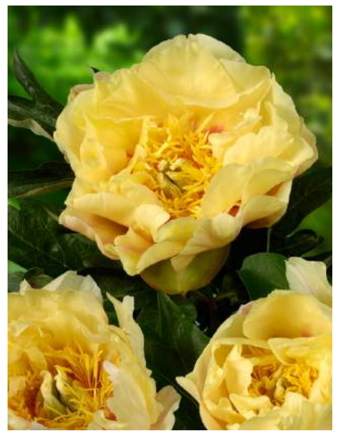
itoh Prairie Charm (1992) Mid. | Pot