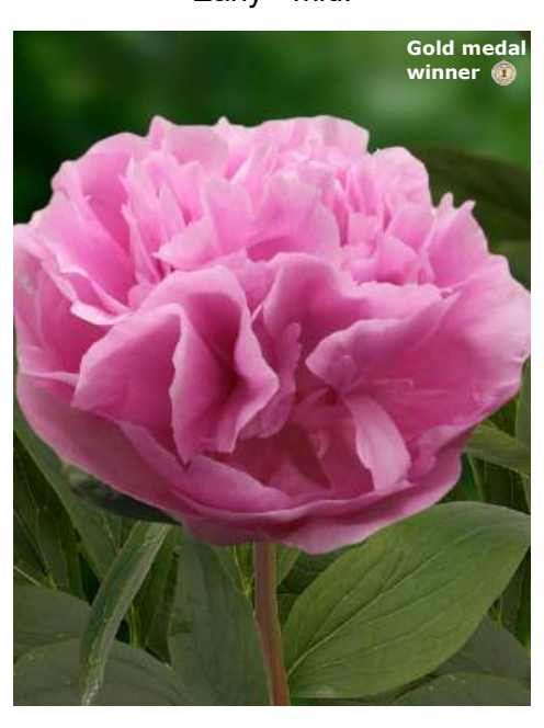
Myra MacRae (1967) Very late