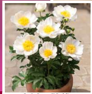
Patio Peony™ Dublin