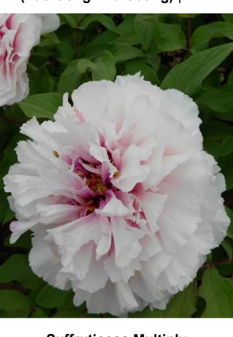
Suffruticosa Multiply (Xue Ying Tao Hua) | Mid.