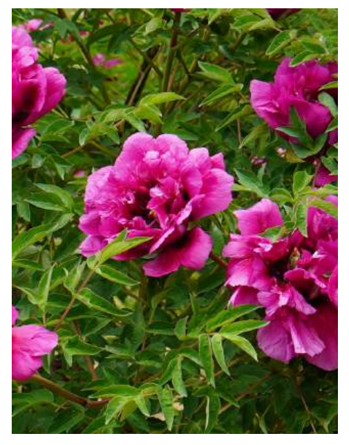
Rockii-Flare Rebel (Gao Yuan Sheng Huo) | Mid.