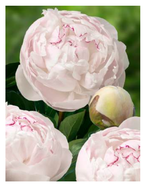
Odile (1928) Early