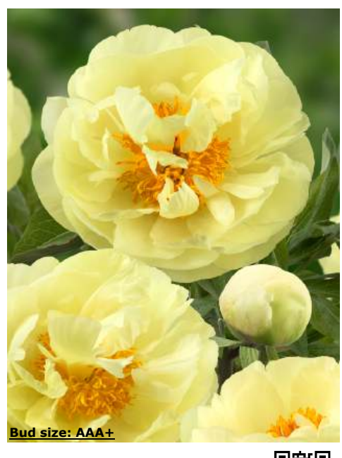
Lemon Chiffon (1981) Very early