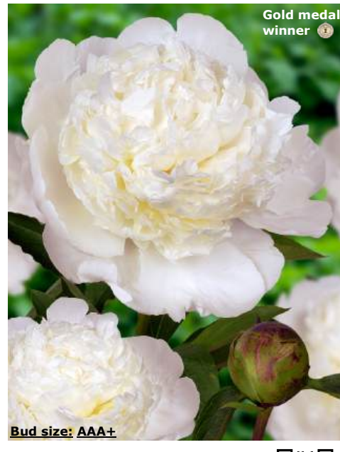
Bowl of Cream (1963) Factor 9 Early - mid.