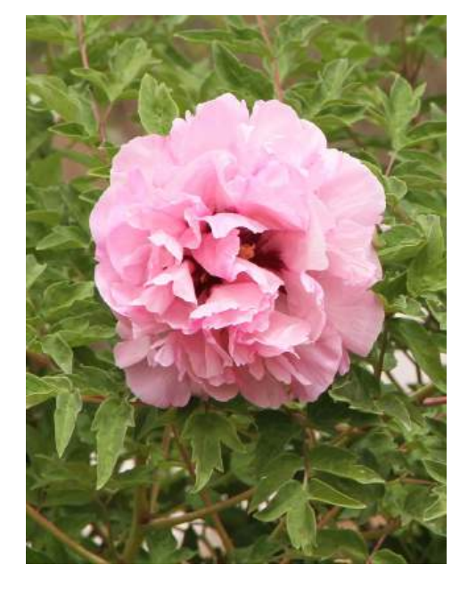
Rockii-Flare Pants (Jing Ming Fen) | Mid.