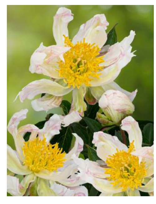
Green Halo (1999) Early - mid. | Pot