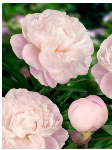
Gardenia (1955) Early - mid. | Pot