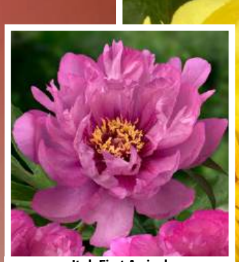
Itoh First Arrival