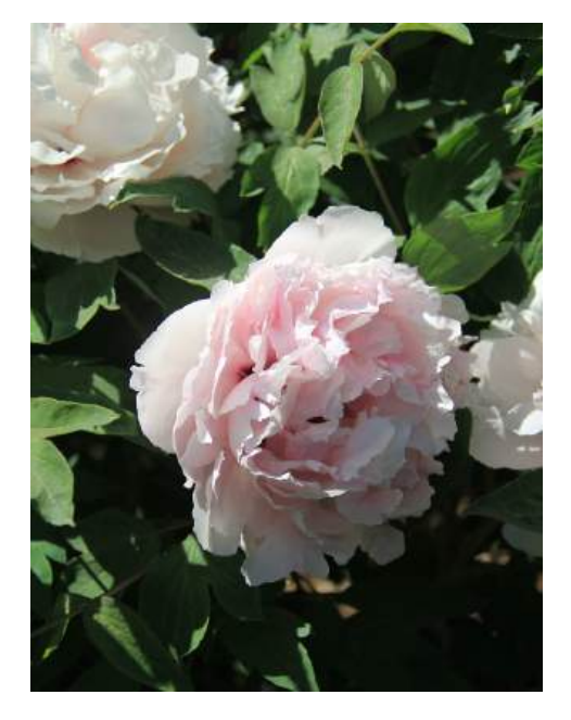
Rockii-Flare Firework (Jing Su Fen) | Mid.