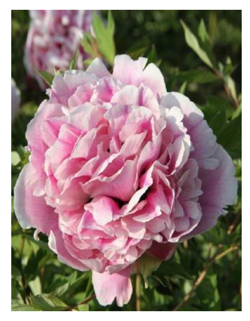
Rockii-Flare Fiesta (Guan Yin Mian) | Mid.