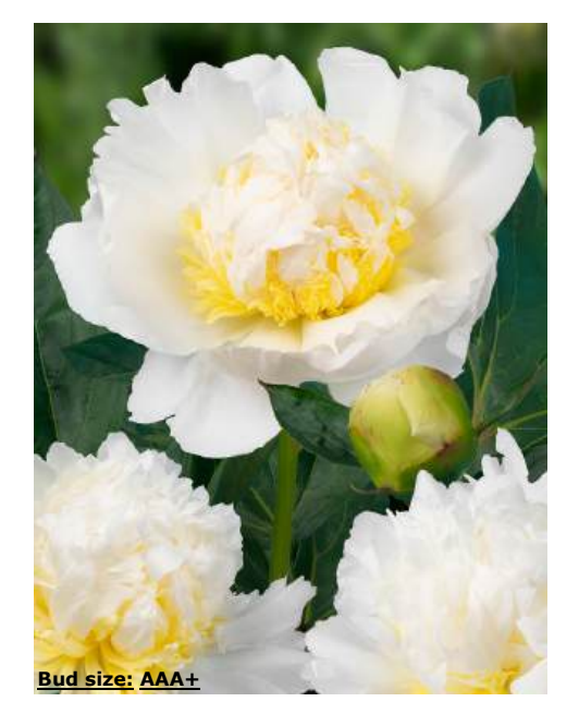
Bridal Icing (1959) Mid.