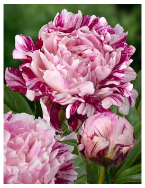
Candy Stripe (1992) Mid. - late