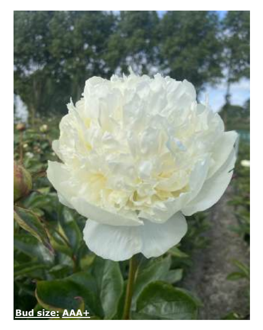
Bridal Gown (1957) Mid. | Pot