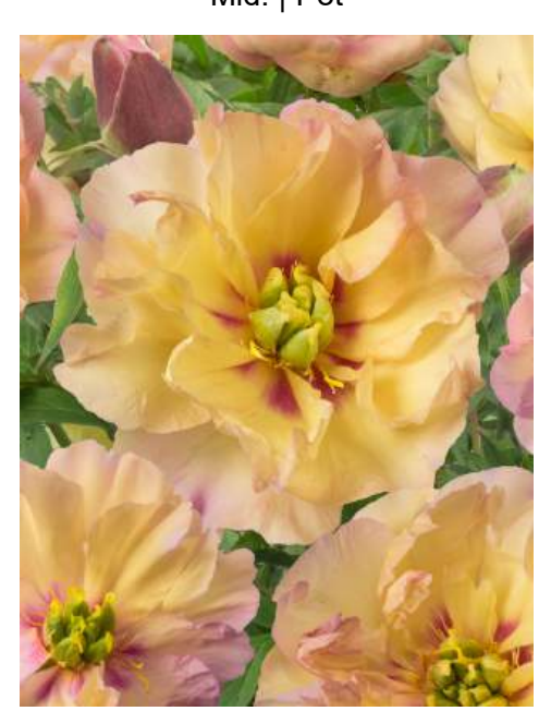
itoh Canary Brilliants (1999) Mid. | Pot