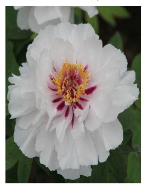
Suffruticosa Bulls Eye (Yue Gong Zhu Guang) | Mid.