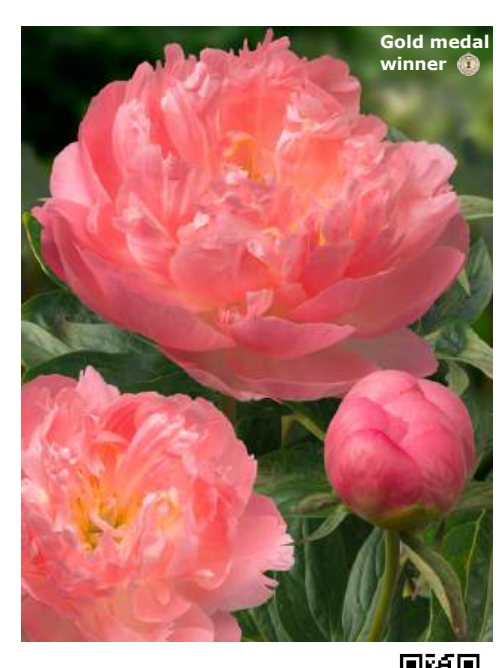
Pink Hawaiian Coral (1981) Early