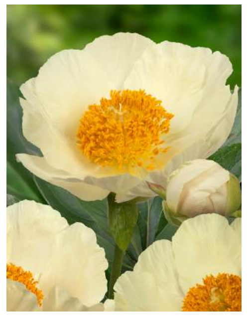
Moonrise (1949) Early | Pot