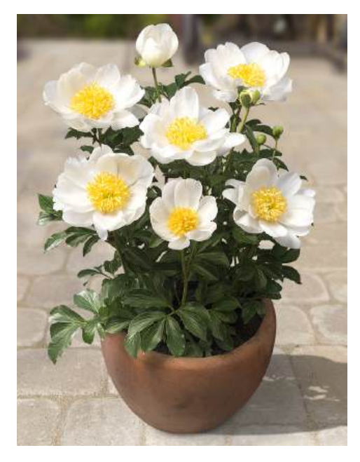
Patio Peony™ Dublin Late