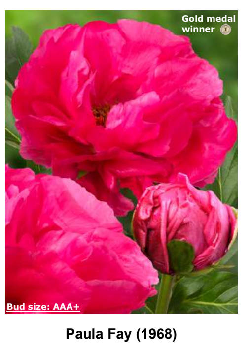
Early | Pot