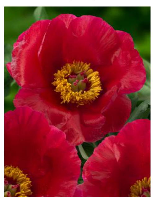
Blaze (1973) Early | Pot