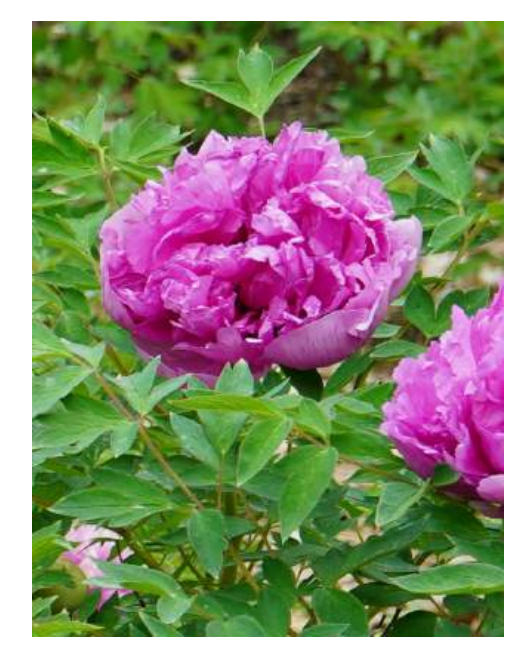
Rockii-Flare Abracadabra (Lan Guan Yu Dai) | Mid.