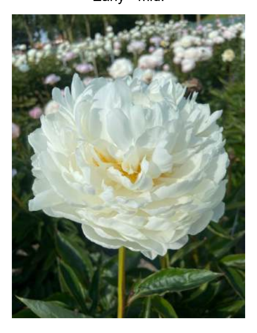
White Ivory (1981) Mid.