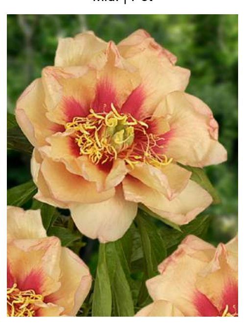
itoh Callie's Memory (1990) Early - mid. | Pot