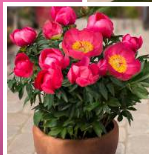
Patio Peony™ Oslo