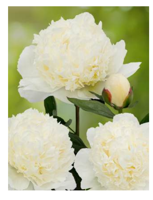
Lancaster Imp. (1987) Early | Pot