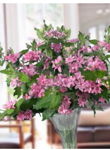
Oxypetalum Bridal Juliette