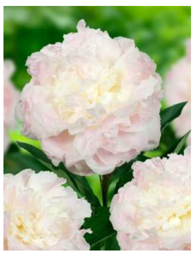
Paeonia Florence Nicholls