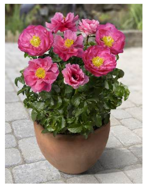
Patio Peony™ Athens Very early