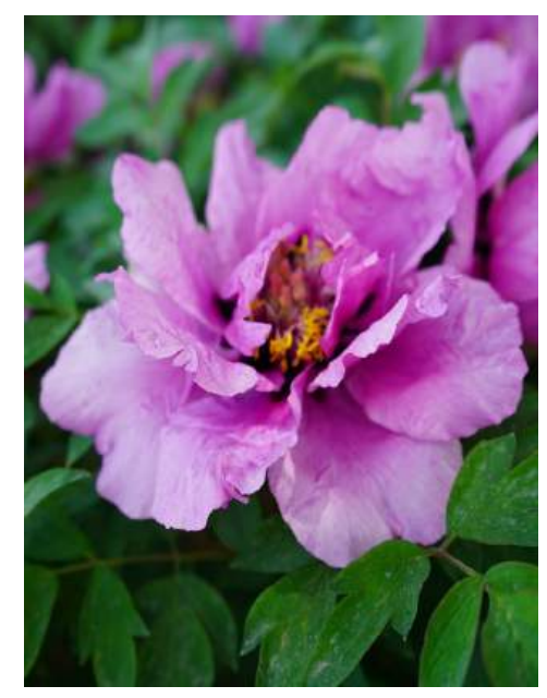
Rockii-Flare Vintage (Jing He Lan) | Mid.