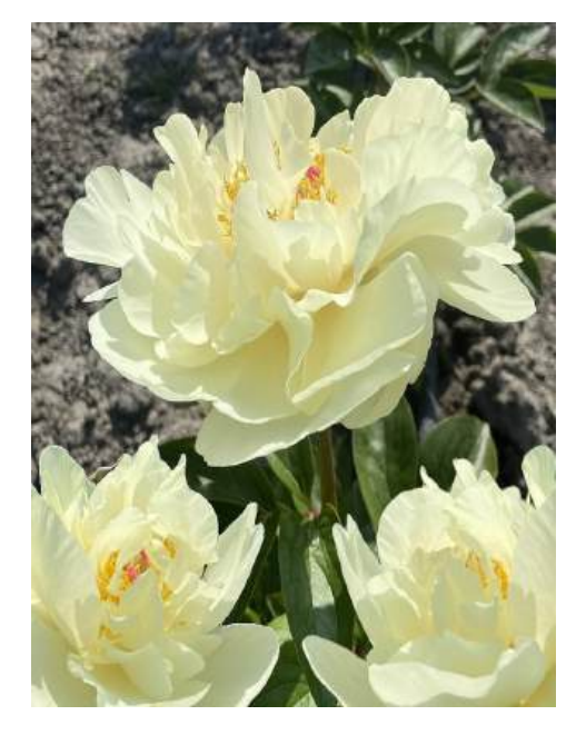
Early Sensation (1988) Early