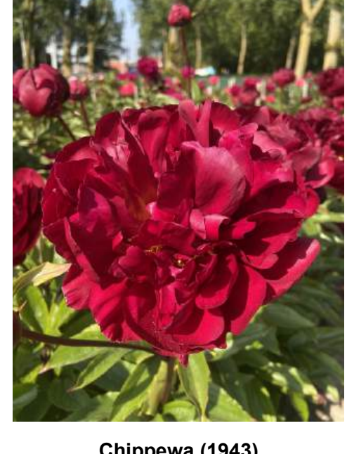
Chippewa (1943) Mid.