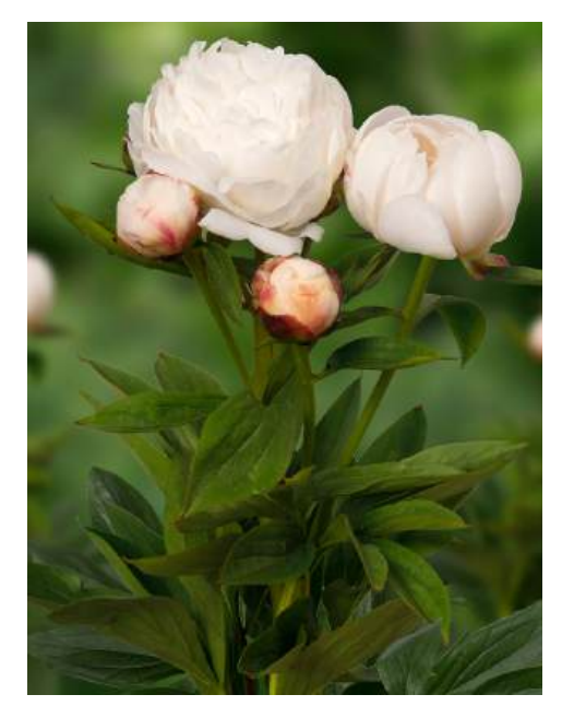
Allan Rogers (2008) Early - mid. | Pot