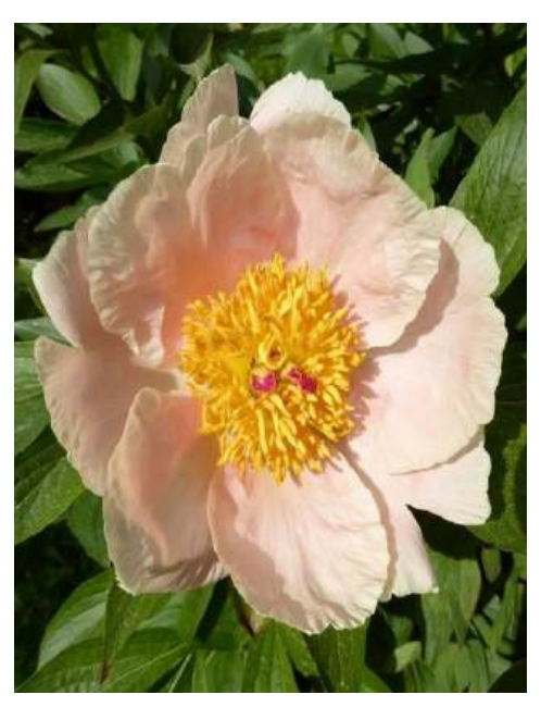
Apricot Whisper (1999) Very early