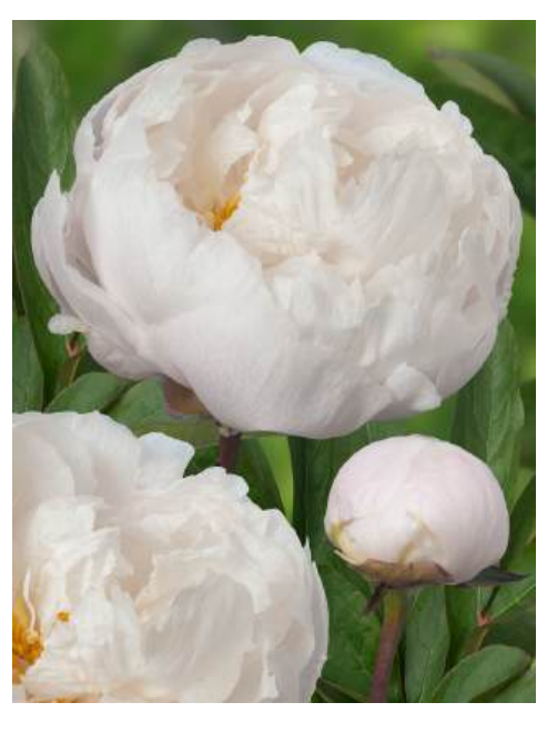
White Grace (2000) Mid.