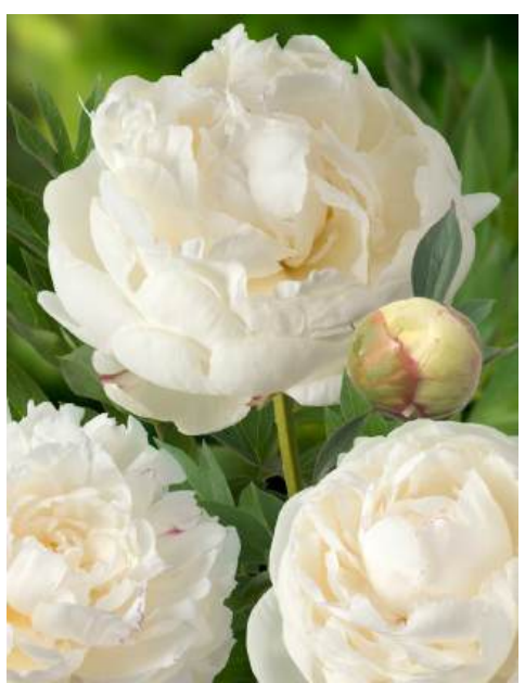
Snow Mountain (1946) Late