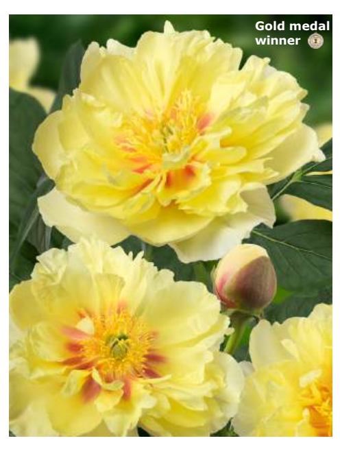
itoh Bartzella (1986) Mid. | Pot