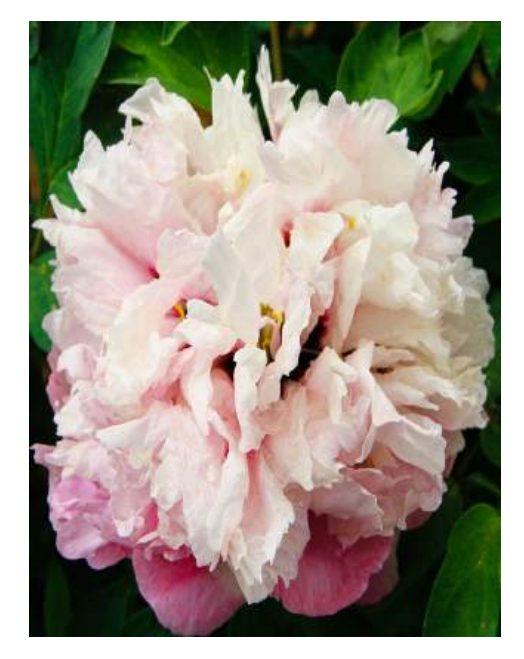
Rockii-Flare Sugarcone (Gui Chuan Fen) | Mid.