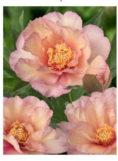
itoh Scrumdidleumptious (2002) Mid. - late | Pot