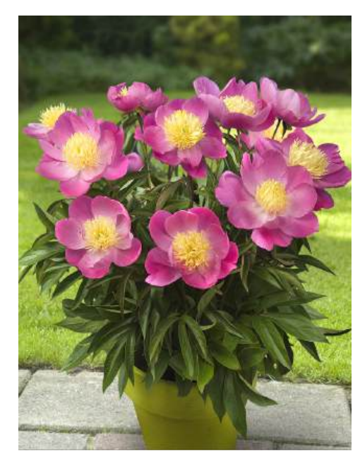
Patio Peony™ Kiev Mid.