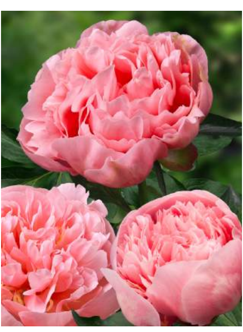
Etched Salmon (1981)