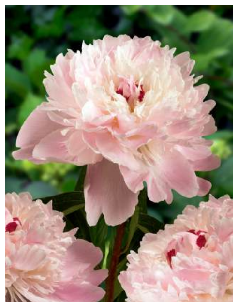
Alertie (<1950) Very early | Pot