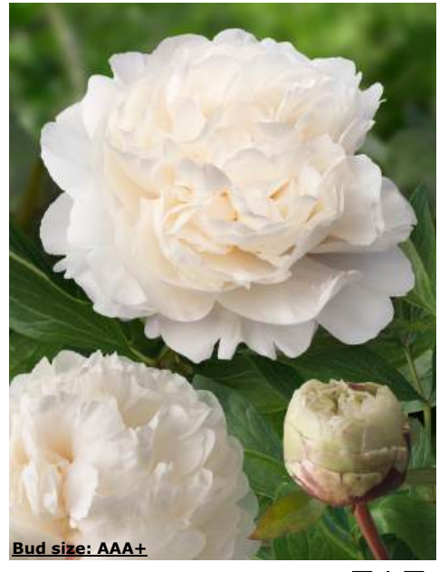
Class Act (1991) Mid.