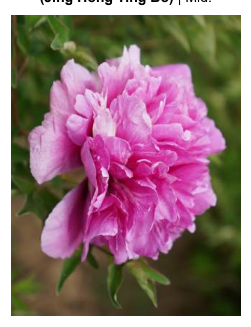
Rockii-Flare Dream (Jing Zui Mei) | Mid.