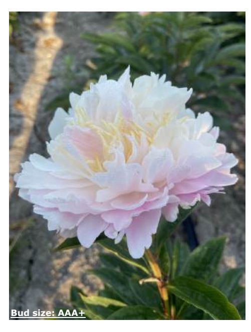
Bella Rosa (-) Mid.