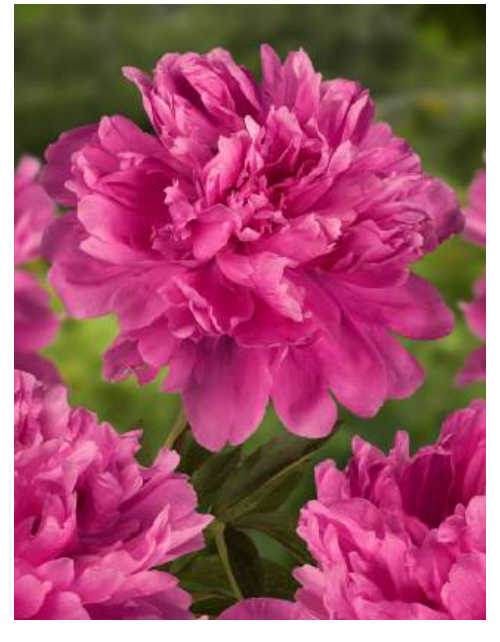
Amabilis (Pink Panther) 1978) Early - mid. | Pot