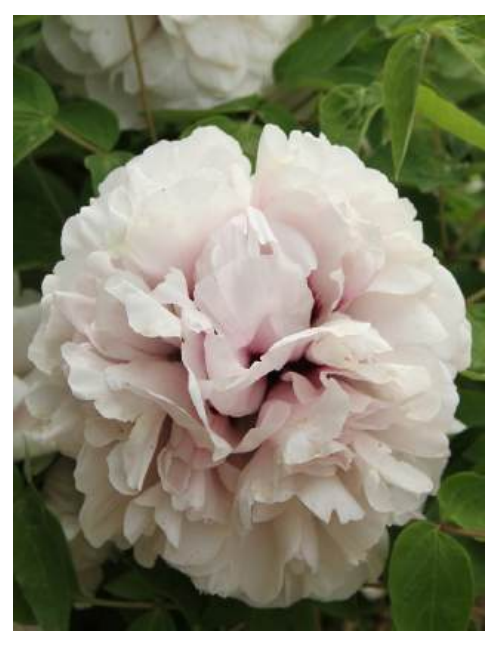
Rockii-Flare Baby Girl (Jing Juan Fen) | Mid.