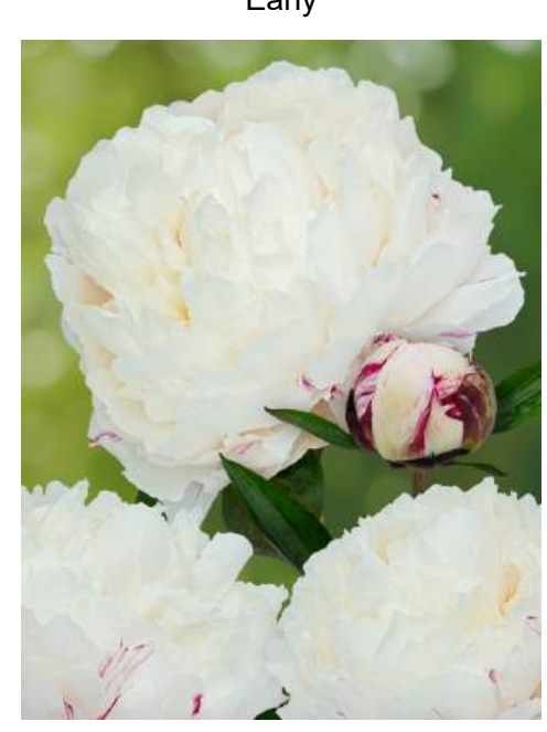
White Lullaby (2000) Mid. - late | Pot