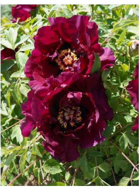
Rockii-Flare Flashlight (Jing Long Wang Yue) | Mid.