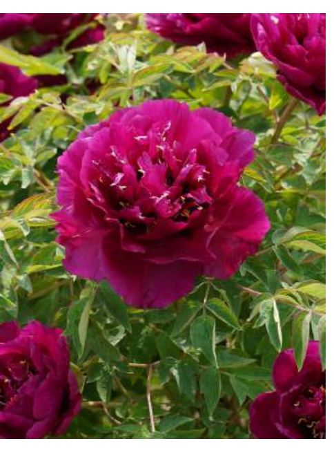
Rockii-Flare Dark Horse (Jing Mo Sa Jing) | Mid.