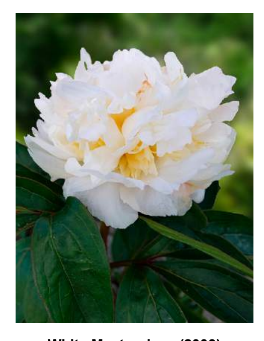
White Masterpiece (2003) Mid.