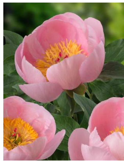
Soft Salmon Saucer (1981) Early