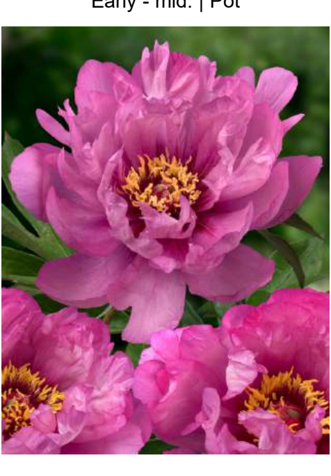
itoh First Arrival (1986) Early | Pot