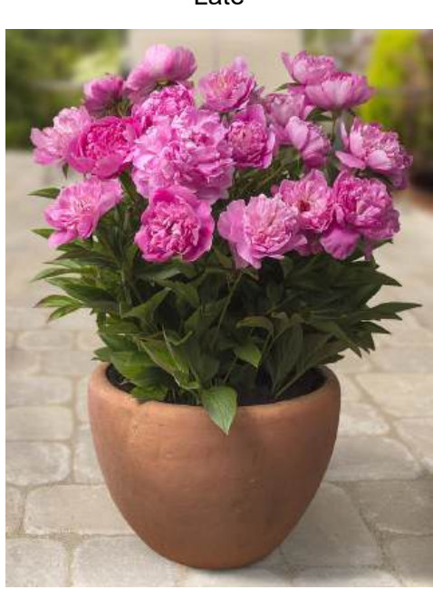
Patio Peony™ Rome Mid.