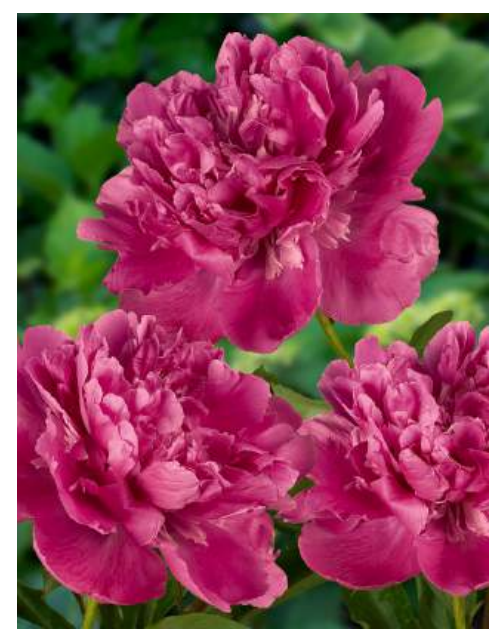
Edulis Superba (1824) 美術語 Early - mid. | Pot Early - mid. | Pot