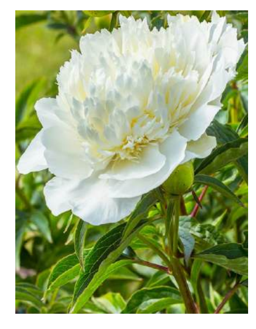
White Charm (1964) Early