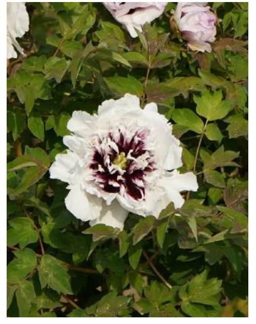
Rockii-Flare Eagle Wings (Jing Yu Tian Cheng) | Mid.