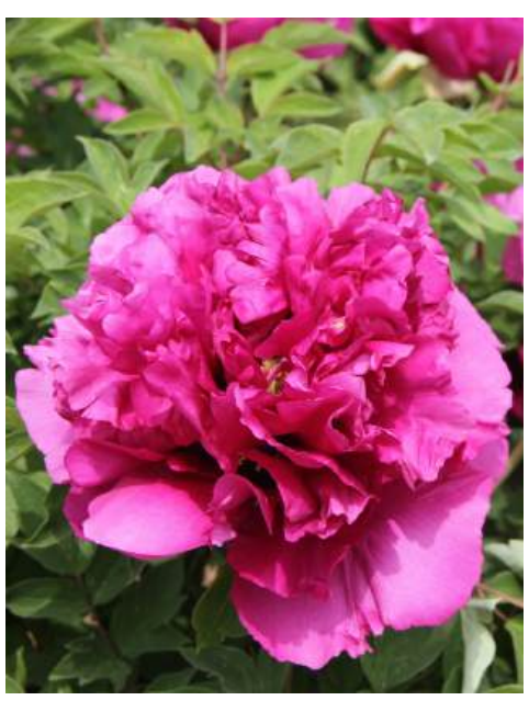
Rockii-Flare Noble Crown (Jing Zi Guan Yin Xian) | Mid.