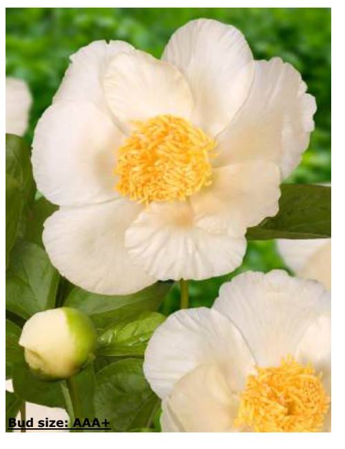
Roy Pehrsons Best Yellow (1982) Very early