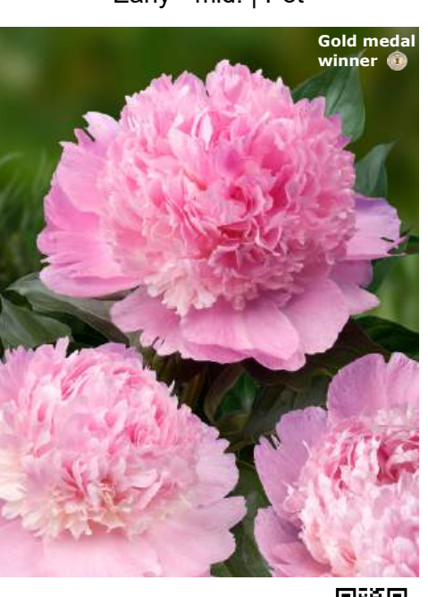
Angel Cheeks (<1975) Early - mid.