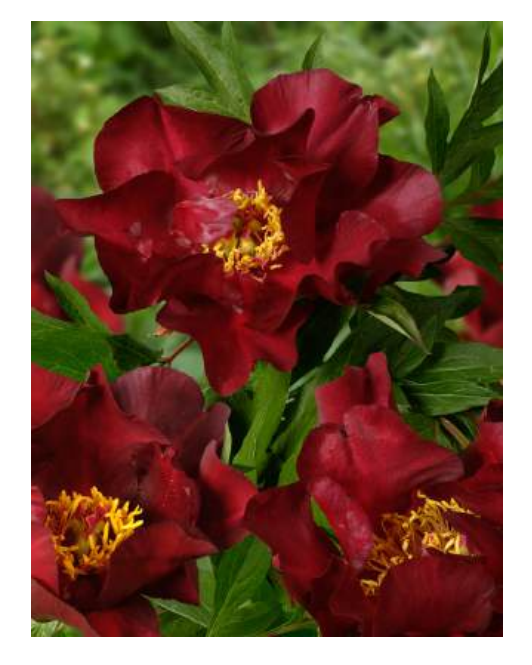
itoh Scarlet Heaven (1999) Early - mid. | Pot