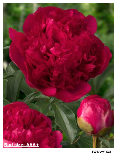
Command Performance (1996) | Early