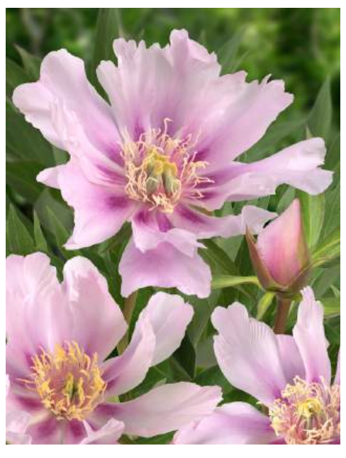
itoh Ballarena de Saval (2001) Mid. | Pot