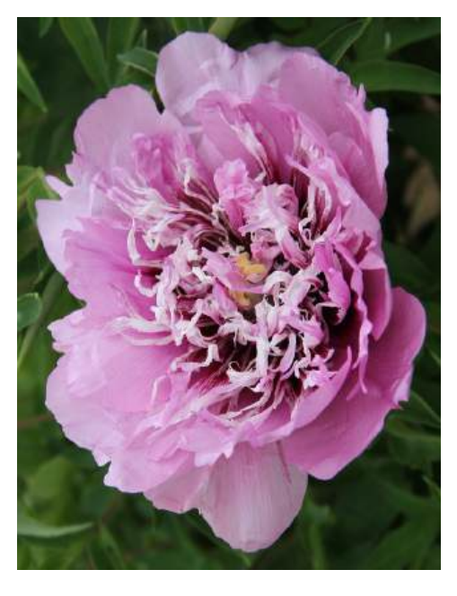
Rockii-Flare Mysterious (Mi Er Mei) | Mid.