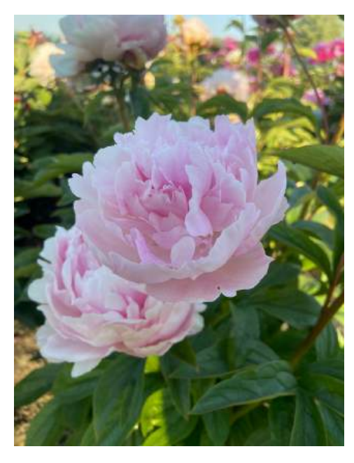
Lady Orchid / Pink Diamond (1942) Mid. - late