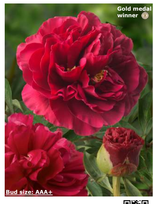
Ole Faithful (1964) Late