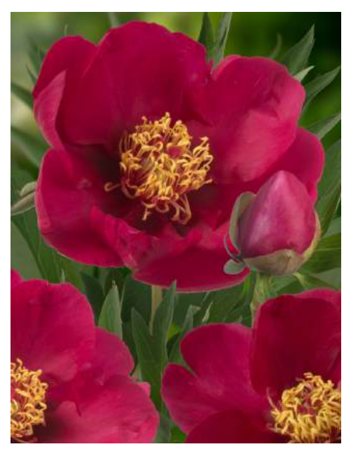
itoh Tolomeo Nr. 59 (2012) Mid. | Pot