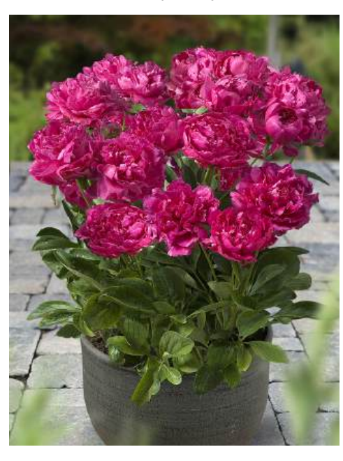
Patio Peony™ London Early