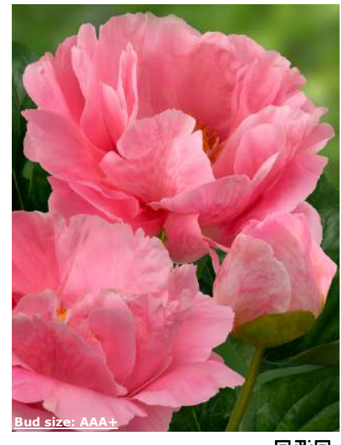
Salmon Chiffon (1981) Early | Pot