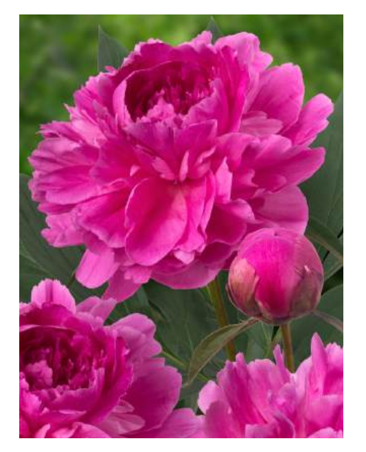
Bunker Hill (1906) Late | Pot