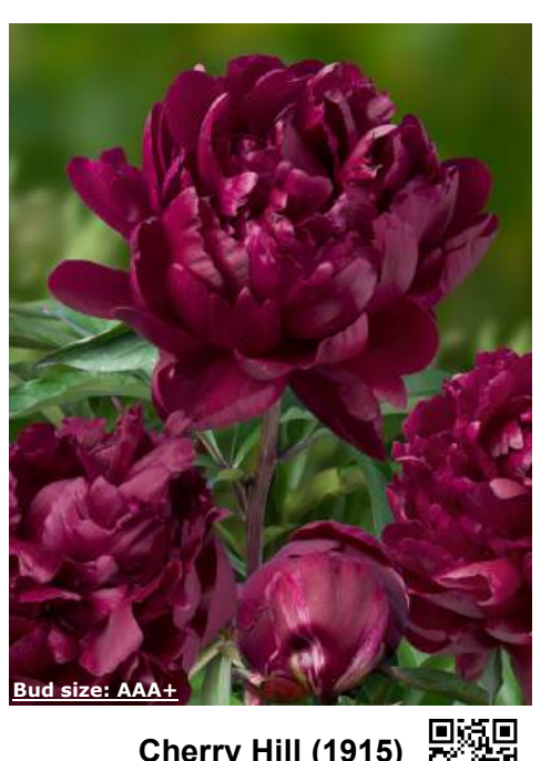
Cherry Hill (1915) Early - mid.