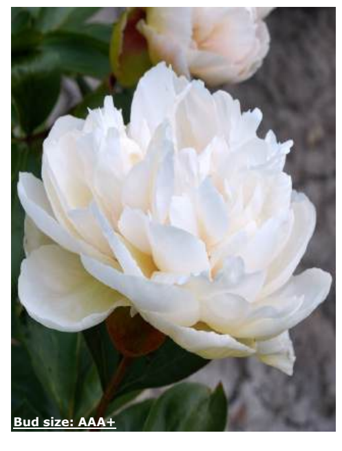
Greenland (1989) Early