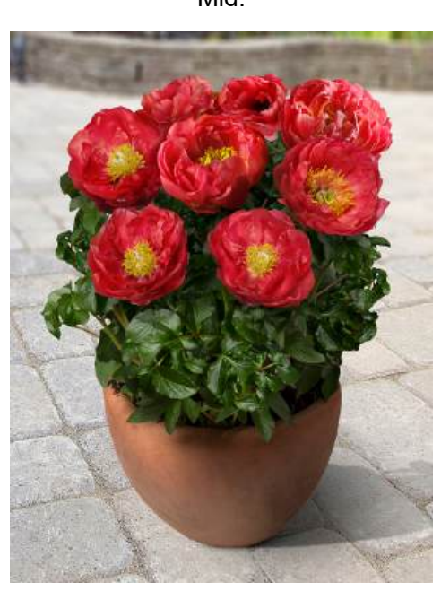
Patio Peony™ Moscow Early - mid.