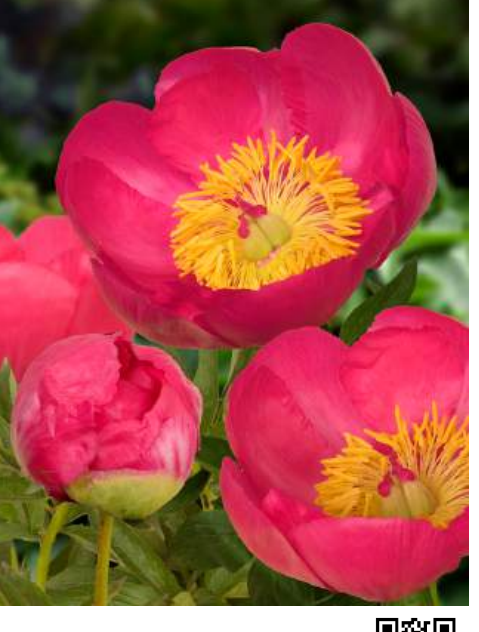
Flame (1939) Early | Pot