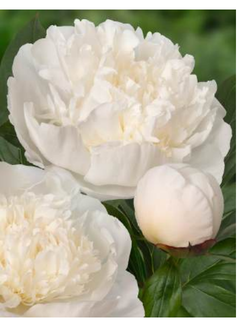
Immaculee (1953) Late | Pot