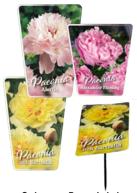
Order your Peony Labels at Green Works