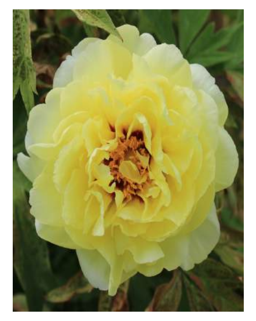
Lutea High Noon Mid.