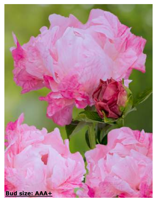
Pink Choice (2019) Early | Pot