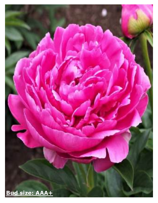
Rozella (1990) Late