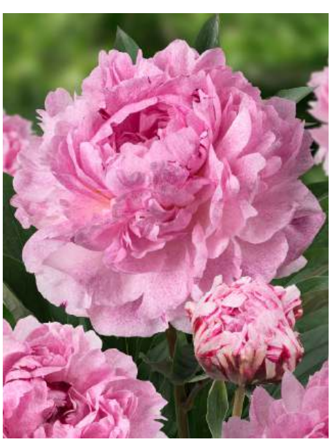
Sarah Bernhardt Unique (1997) | Late