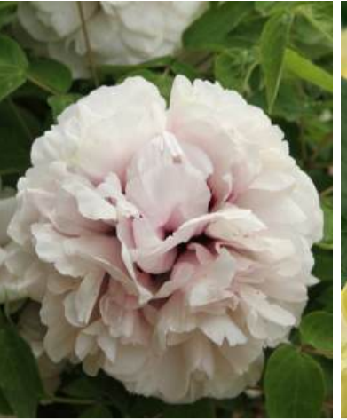
'Tree Peony Baby Girl'