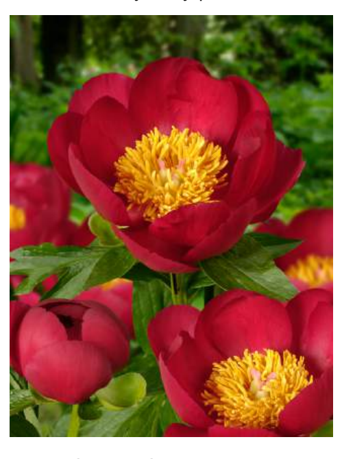
Scarlet O'Hara (1956) Early