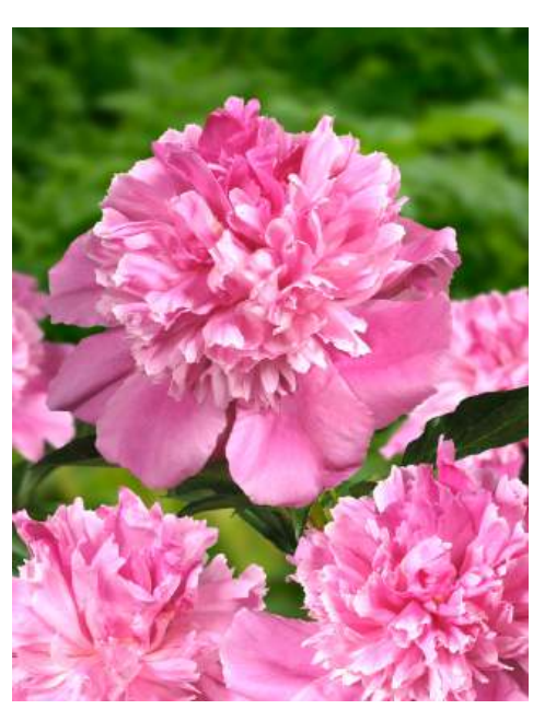
Bouquet Perfect (1987) Early - mid. | Pot