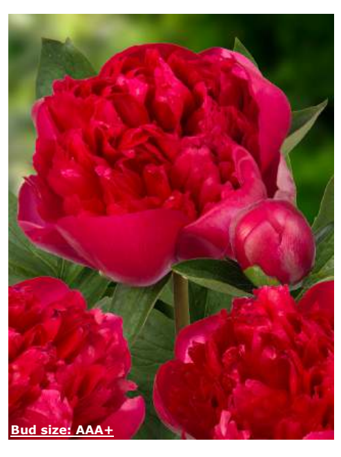
Belgravia (1978) Early