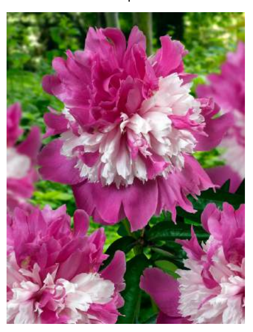
Celebrity (1985) Early - mid.