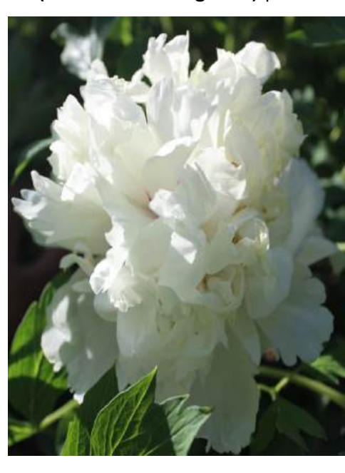
Rockii-Flare Whitewash (Ping Ding Iv) | Mid.