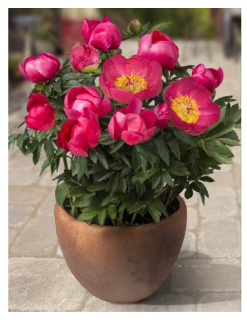
Patio Peony™ Oslo Very early