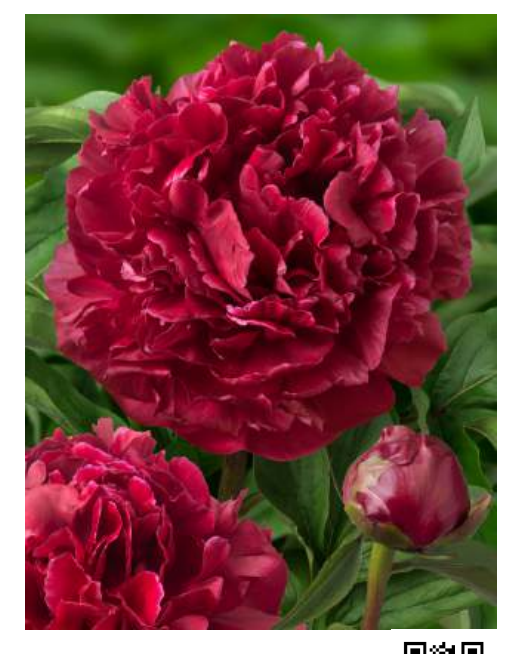
Highlight (1952) Early - mid.