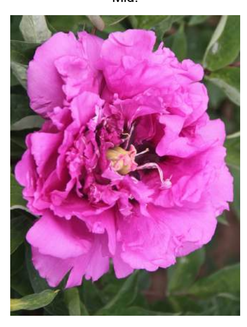
Rockii-Flare Ballroom (Lan Hai Cha Cui) | Mid.