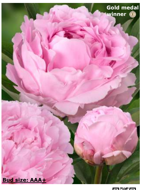
Pillow Talk (1973) Late