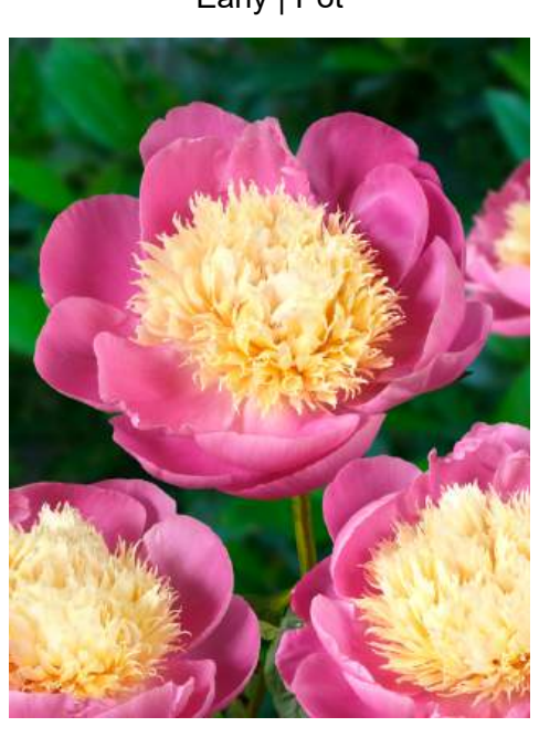
Bowl of Beauty (Globe of Light) (1949) | Early - mid.