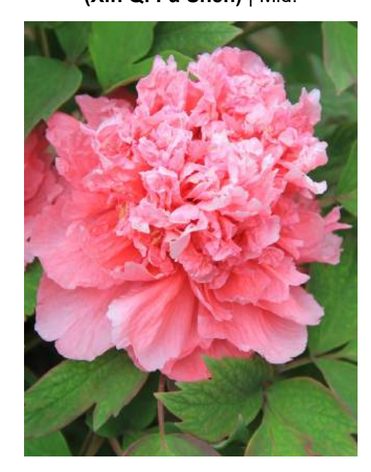
Suffruticosa Pink Sky (Hu Hong) | Mid.