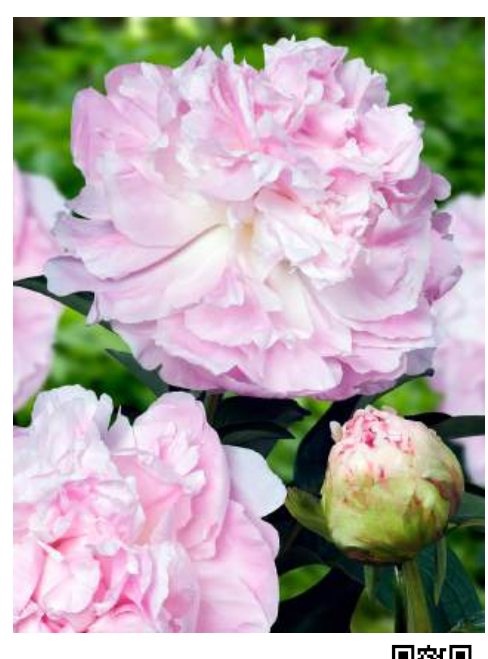
My Love (1992) Early - mid.