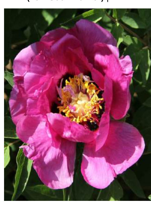
Rockii-Flare Bingo (Jing Hong Ying Bo) | Mid.