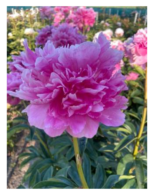
Glory Hallelujah (1970) Late