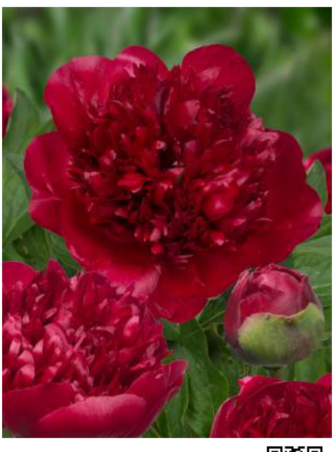
Christmas Velvet (1992) 真然间 Farly 回热键 Early