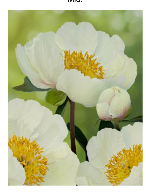
Claire de Lune (1954) Very early