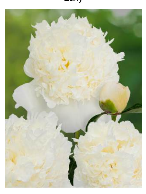
Princess Bride (1988) Early