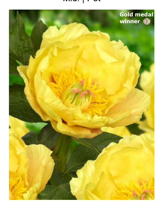
itoh Garden Treasure (1984) Mid. | Pot