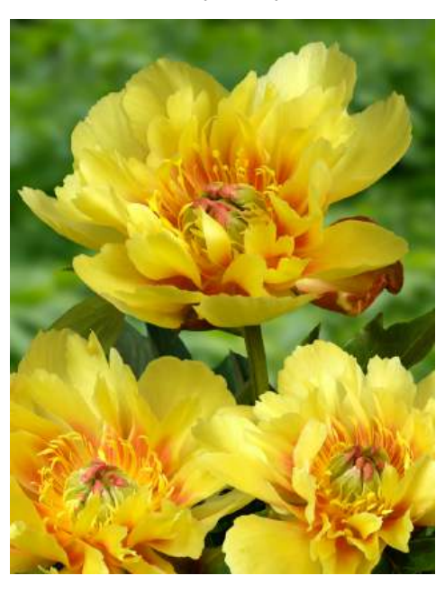
itoh Border Charm (1984) Mid. - late | Pot