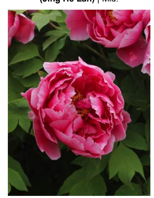
Suffruticosa Dragon Wing (Xin Qi Fu Shen) | Mid.