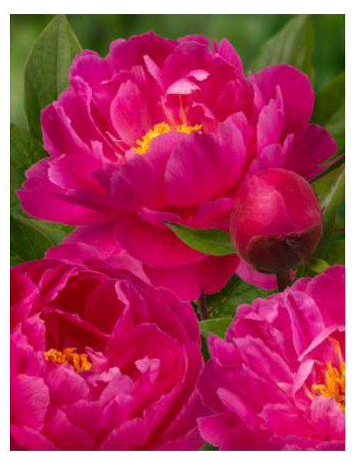
Nice Gal (1965) Early - mid. | Pot