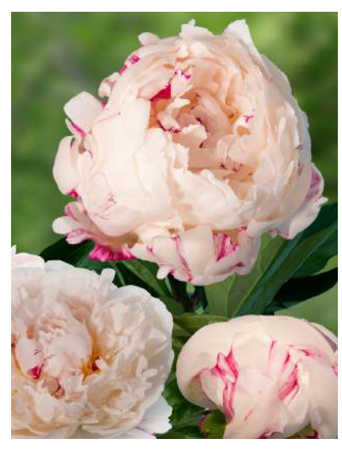
Chinook (1981) Very late