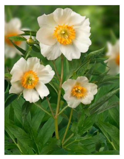
Early Windflower (1939) Very early | Pot