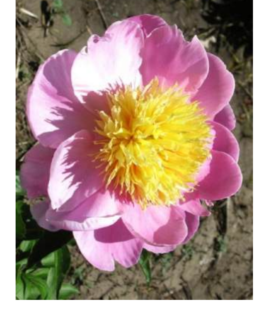
Nippon Gold (1929) Late