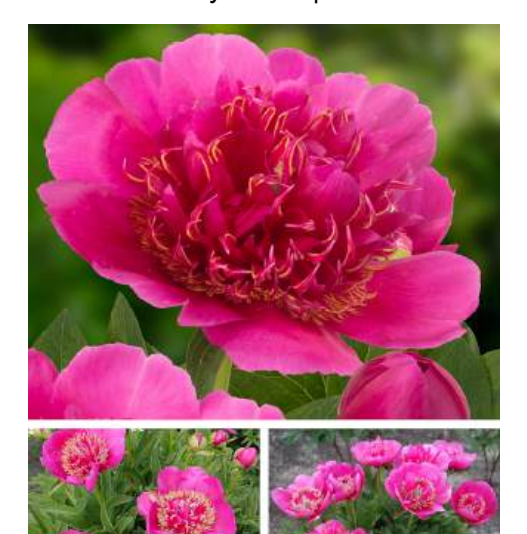
Anemoniflora (<1900) Very early | Pot