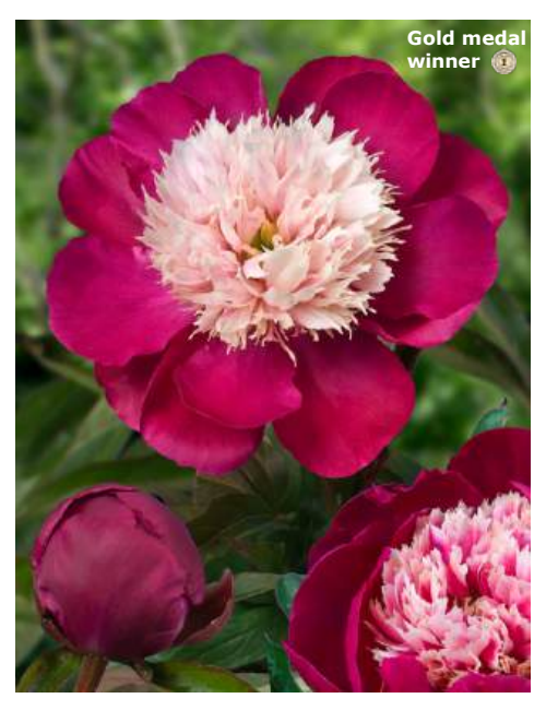
White Cap (1956) Early - mid.