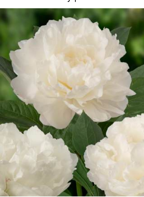
Fringed Ivory (1989) Mid.