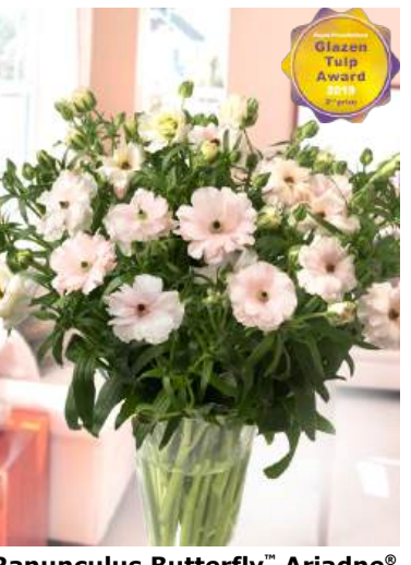
Agapanthus<sup>™</sup> Summer Love<sup>®</sup> Ranunculus Butterfly<sup>™</sup> Ariadne<sup>®</sup>