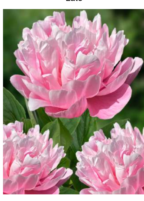
Pink Parfait (1975) Late