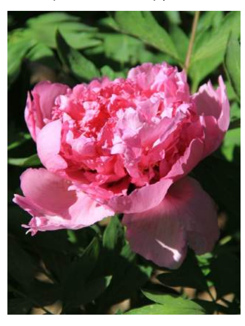
Rockii-Flare Gentle Touch (Qian Zi Bai Tai) | Mid.