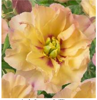
Itoh Canary Brilliants