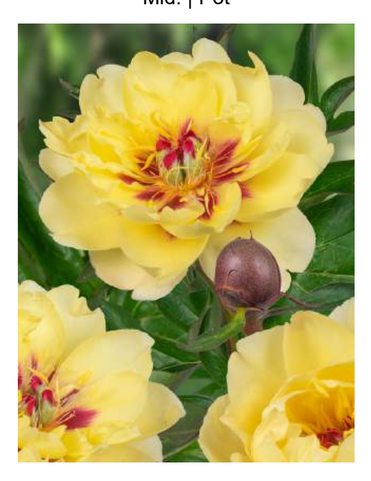
itoh Yellow Waterlily (1999) Mid. | Pot