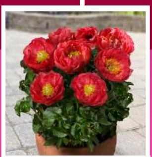
Patio Peony™ Moscow