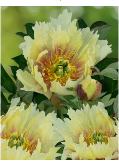
itoh Yellow Dream (1964) Mid. | Pot