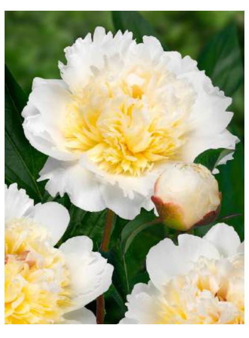
Bridal Grace (1999) Mid.